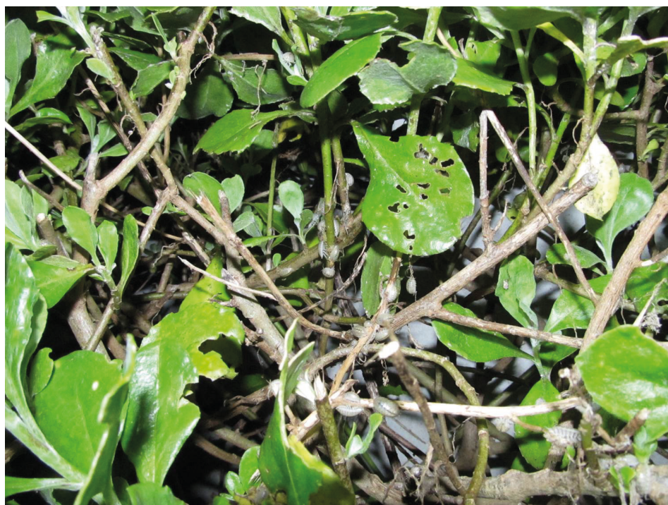
Fig. 3. Photograph at night of individuals of the isopod Tylos capensis climbing on stems and leaves of the bietou bush Chrysanthemoides monilifera rotundata along a walkway near The Promenade of Umhlanga beach, South Africa. Note the holes and cut-out margins of some of the leaves indicating feeding activity.

Tylos capensis exhibits an unusual behavior for a terrestrial isopod: it not only eats live leaves still connected to a plant (rather than dropped as litter), but also climbs up stems as high as 1 metre or more above the ground to reach them. Furthermore, it can