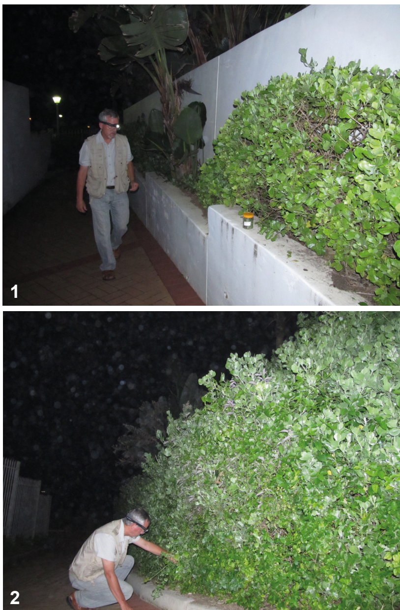
Figs 1, 2. Photographs at night of senior author D.S. Glazier near rows of bietou bushes Chrysanthemoides monilifera rotundata along walkways near The Promenade of Umhlanga beach, South Africa. These are two of the sites where numerous individuals of the isopod Tylos capensis were observed climbing on bietou bushes.

edges), whereas those from Yzerfontein were thicker (more succulent) and more smoothly rounded, thus more closely matching those of the subspecies C. monilifera rotundata observed at our field site in Umhlanga (cf. Weiss et al. 2008). However, the