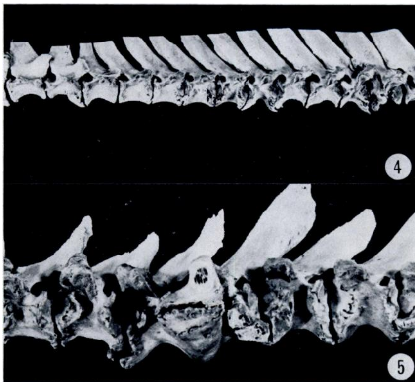
FIGURE 4. Lateral view of macerated vertebral column (thoracic) of 9 year old male deer. Osteophytes are present on the lateral and ventral margins of many vertebral bodies.

Degenerative changes were observed in the cartilage on the anterior aspect of the femoral head, and on both articular surfaces of the atlanto-occipital joint. Vertebral body osteophytes were present on the anterior margins of vertebrae T 4 to T 8 and T 11 , and on the posterior margin of vertebrae T 3 to T 11 and L 6 . Intervertebral discs were absent in the intervertebral spaces from T 3-4 to T 9-10 . The largest osteophytes (1-2 cm) were located on the posterior aspect of T 8 , T 9 and T 10 and occupied a lateral position on the vertebral body.