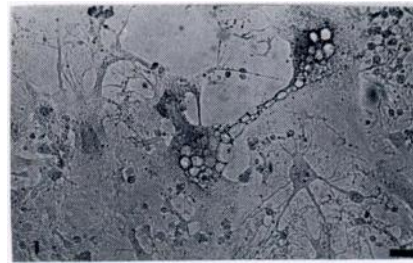
Photomicrograph of Vero cell inoculated with buffy coat cell blood fraction from PPR virus-inoculated deer. Note the CPE. Bar = 100 \mu m.

The three deer that survived the PPR virus infection (bucks #1, 4 and 5) developed virus neutralizing antibodies in their sera (Table 2).