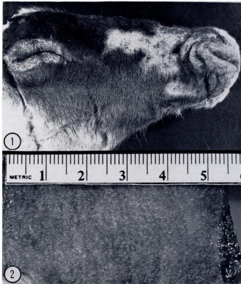
FIGURE 1. Lateral view of head of woodland caribou. Alopecia over nose and about eye, with thickening and folding of skin about nares.

When the mucosa was stripped from the turbinates the underlying bone was pitted with numerous 0.5-1.0 mm cavities which appeared to have enclosed cysts located in the periosteum or mucosa. Numerous 0.5 mm cysts were found bulging into the lumen of major veins of the head, and similar cysts were evident on the conjunctiva and sclera of both eyes. The suprapharyngeal lymph nodes were edematous and had a yellowish discoloration on section. No gross lesions were detected in the oral cavity or brain.