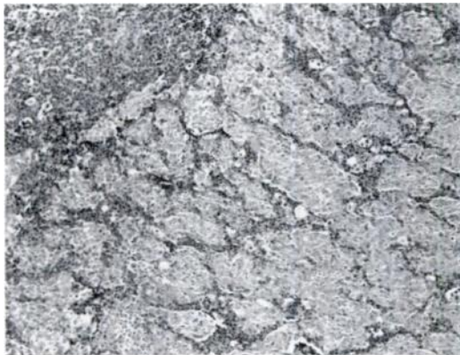
FIGURE 1. Note the compression and invasion of normal kidney by the neoplasm. H&E. \times 60 .

Received for publication 23 August 1982.