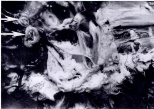
FIGURE 1. Concave plaques (arrows) of Aspergillus fumigatus in a captive tawny eagle.