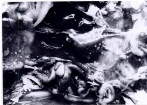
FIGURE 2. Extensive plaque formation with adhesion (arrows) of organs in the abdominal cavity of a captive tawny eagle.

alus ), martial eagle ( Polemaetus bellicosus ), European sparrow hawk ( Accipiter nisus ), tawny owl ( Strix aluco ), barn owl ( Tyto alba ) and golden eagle ( Aquila chrysaetos ) (Coon and Locke, 1968, Bull. Wildl. Dis. Assoc. 4: 51; Cooper, 1969, Vet. Rec. 84: 454–457; Keymer, 1972, Vet. Rec. 90: 579–594; MacDonald, 1965, Bird Study 12: 181–195; O'Meara and Witters, 1971, op. cit.; Waterston, 1959, Br. Birds 52: 197). However, there appear to be no references on aspergillosis in Abyssinian tawny eagles. This communication therefore reports its occurrence in a captive Abyssinian tawny eagle.