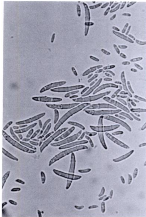
FIGURE 1. Microconidia and macroconidia of Fusarium oxysporum NVZC 8401 isolated from the kidney of a red sea bream. \times 400 .

The fungus was isolated by incubating a piece of kidney on Sabouraud dextrose agar (SA agar) at 25 C, and a pure culture was obtained. Fungal colonies were subcultured onto SA agar and identified as Fusarium oxysporum Schlecht as de-