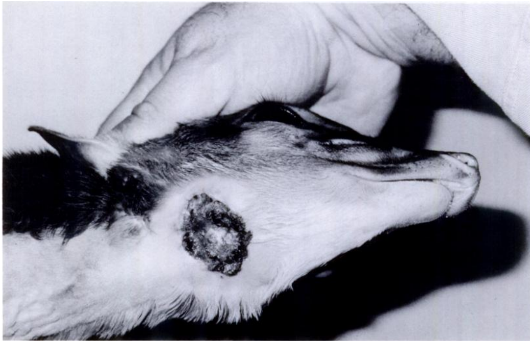
FIGURE 1. Draining right submandibular abscess from a blue duiker with a submandibular salivary gland fistula and extensive soft tissue necrosis.

mandibular bone; some were approximately four times normal thickness, primarily in mid shaft, tapering toward both ends with no gross abnormality of the associated dental arcade (Fig. 3). One duiker had a submandibular salivary fistula associated with the abscess site.