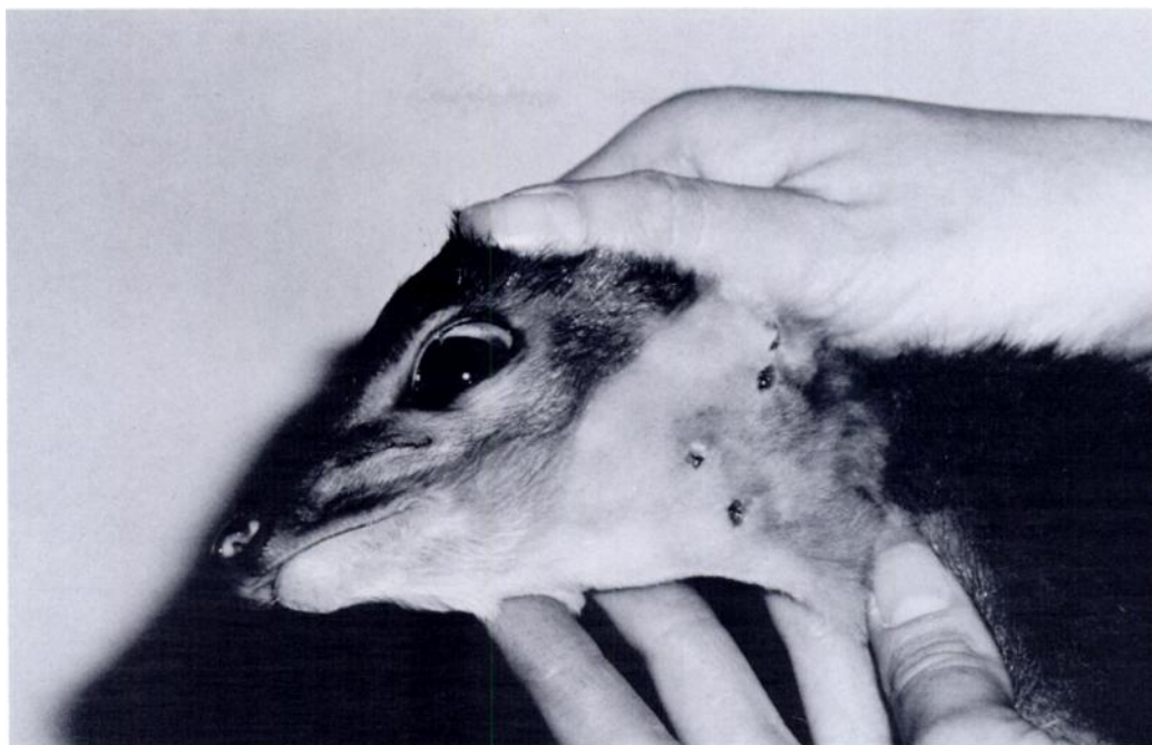
FIGURE 2. A young duiker exhibiting multiple draining sites of left facial abscessation extending from the base of the ear to the left jugular furrow.

by domestic livestock with footrot infections have been cited as contributing factors (Wobeser et al., 1975; Rosen, 1981; Carter, 1984). The blue duikers affected at our facility may have been overcrowded, especially when housed as an adult trio with nursing offspring. However, facial and mandibular abscesses in this herd appear to be related to the introduction of infected carrier animals brought to the PSU Deer and Duiker Research Facility from another zoological garden, coarse feed texture and masticatory behavior. Abscesses were most often on the right side of the face or jaw which correlates with observed patterns of mastication. The majority of duikers in the herd chew with a clockwise motion in which most of the food is kept on the right side of the oral cavity as the mandible is shifted (B. L. Roeder, unpubl. obs.). Fusobacterium necrophorum is usually considered to be unable to penetrate the intact mucosa (Jubb et al., 1985) and sharp or coarse plant material such as grass awns or forage particles are implicated as im-