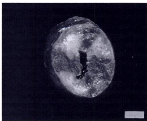
FIGURE 1. Cross-section of heart from mallard with staphylococcosis. Pale foci of fibrosis and necrosis are evident in the myocardium. (Bar = 5 mm.)