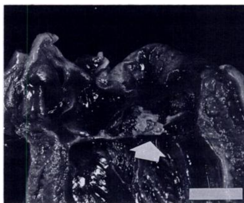
FIGURE 2. Opened left ventricle of the heart from a mallard. There are vegetative growths on the atrio-ventricular valves (arrow). Staphylococcus aureus was isolated from this material. (Bar = 1 cm.)

Staphylococcus aureus was isolated from liver of the birds with endocarditis but not from liver of the other four intact birds collected on 8 February. Staphylococcus aureus also was isolated from spleen and kidneys of birds with endocarditis, and from lung and heart valves of one bird. Other bacteria, including Serratia sp., Lactobacillus sp., Yersinia enterocolitica , Vibrio fluvialis , and gamma Streptococcus sp., isolated in small numbers from liver of birds collected 8 February (both those with endocarditis and those without), were considered to be contaminants. Staphylococcus aureus was isolated in pure culture from the bone marrow of a male collected 13 March. Only the head, neck, skeleton and wings were available for examination from this bird.