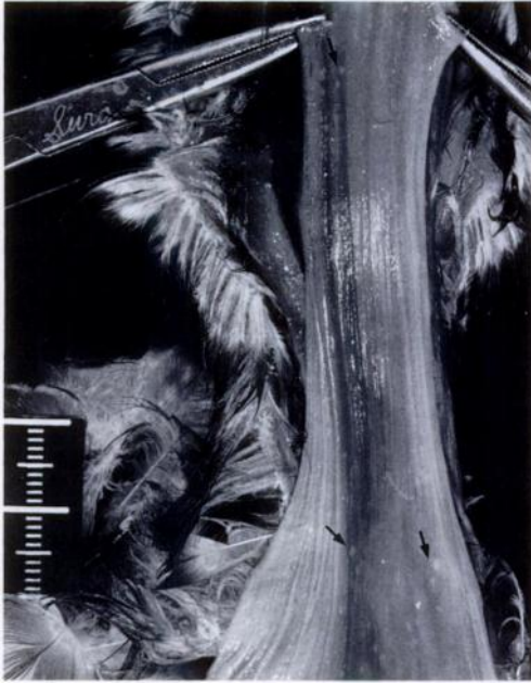
FIGURE 3. Esophagus of a mallard. Many tiny, raised, white foci are present in the mucosa (arrows). The microscopic appearance of these is shown in Figure 4. (Bar = 2 cm.)

was made along the river and scavengers were active at the site, so the birds found dead represented an unknown proportion of those that died.