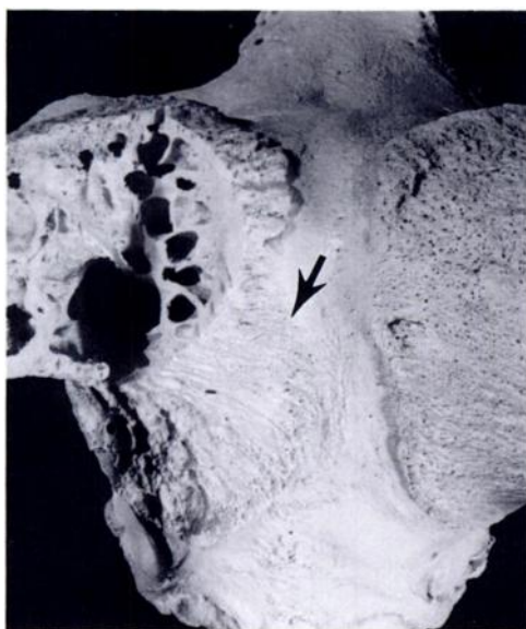
FIGURE 2. Chronic infection resulted in extensive bone loss at the base of the left cornual process (arrow).