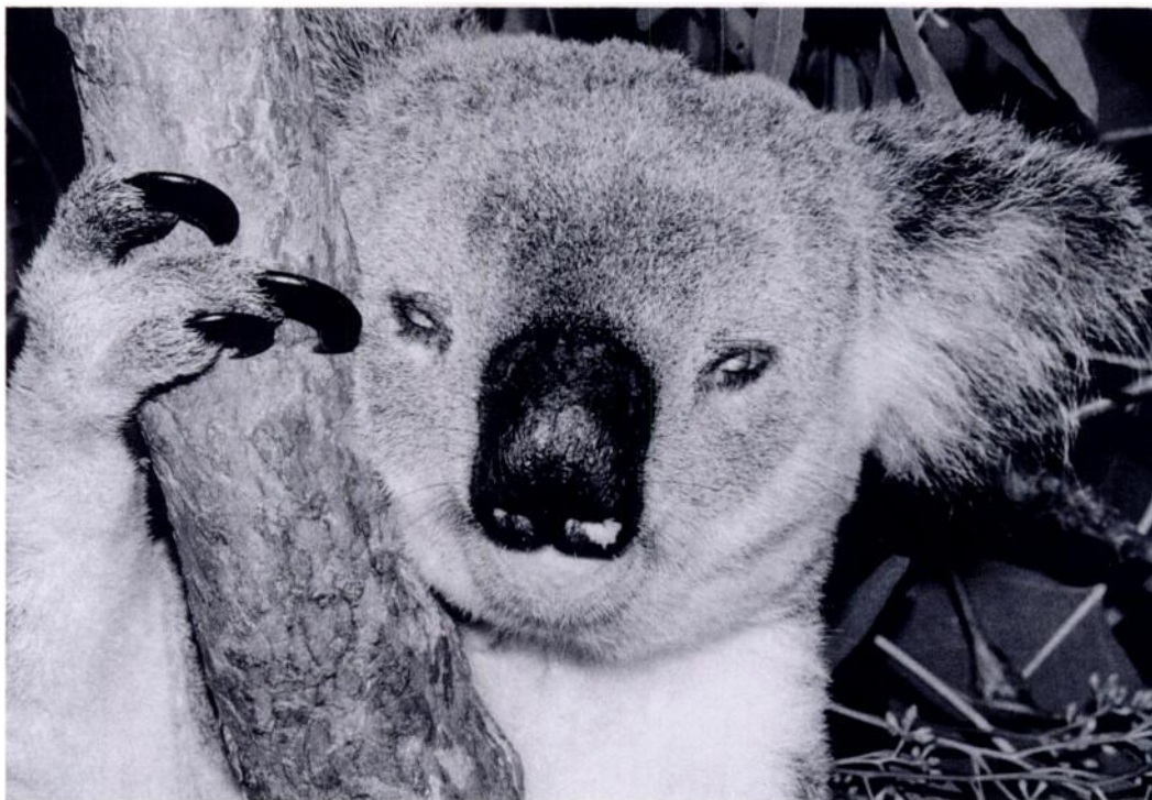
FIGURE 1. Koala showing bilateral old keratitis and opaque corneas from old keratitis.

oedematous nor infiltrated with inflammatory cells, and the conjunctiva was unremarkable.