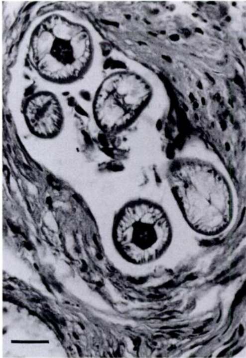
FIGURE 1. Larval Physocephalus sp. within a chronic granulomatous cyst in the stomach of the blue spiny lizard, Sceloporus serrifer . H&E. Bar = 100 \mu m.