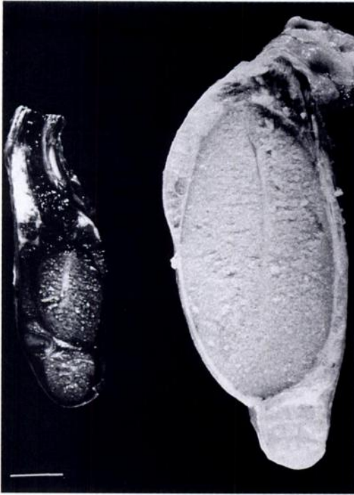
FIGURE 1. Testis of deer with testicular hypoplasia compared with a testis of a normal deer of similar age. Bar = 1 cm.