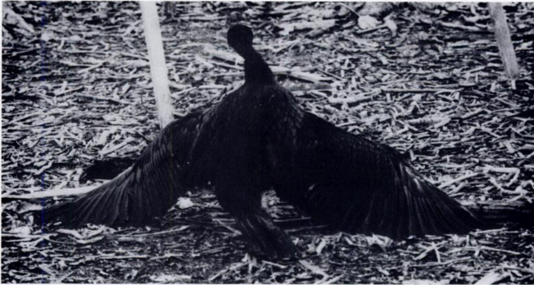
FIGURE 3. Double-crested cormorant with bilateral leg paralysis due to Newcastle disease. It is trying to move forward by use of its wings pivoted against the ground, and is leaning on the ground with its tail.

wings, tail, or both. They were capable of flying and swimming, but were unable to dive. They often rested in sternal recumbency, whereas normal cormorants usually rest standing. Cormorants with bilateral leg paralysis sometimes showed knuckling