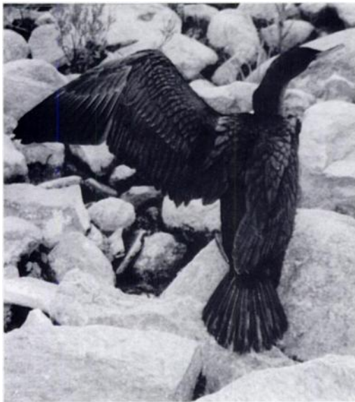
FIGURE 4. Double-crested cormorant with unilateral wing paralysis due to Newcastle disease. The normal wing is spread and the affected wing is held close to the body.

wings, tail, or both. They were capable of flying and swimming, but were unable to dive. They often rested in sternal recumbency, whereas normal cormorants usually rest standing. Cormorants with bilateral leg paralysis sometimes showed knuckling