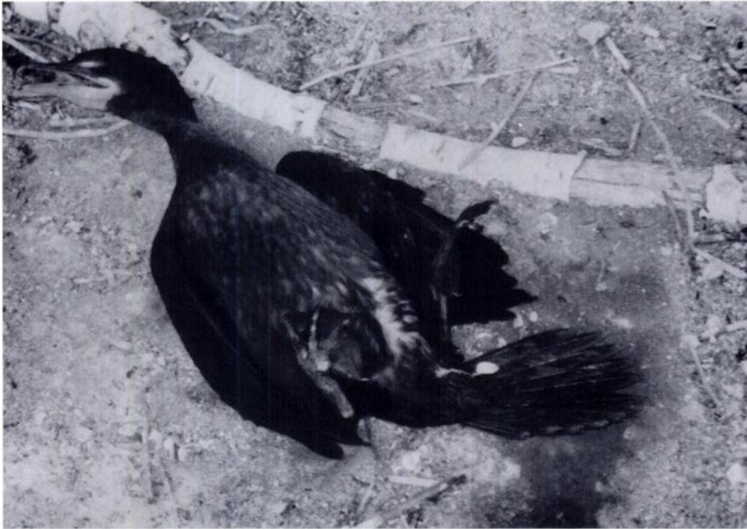
FIGURE 5. Double-crested cormorant with unilateral wing paralysis due to Newcastle disease. It is lying on its back and has difficulty in righting itself. Note the scuff marks on the ground caused by the tail movements.

unable to right themselves if they fell on their back.