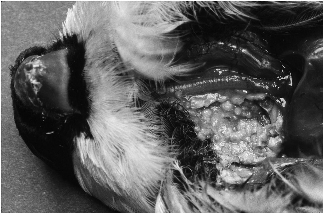
FIGURE 1. Bullfinch ( Pyrrhula pyrrhula ) with extensive and confluent necrosis in the crop wall protruding into the lumen.

Our study supports earlier findings that finches, like bullfinch, Eurasian siskin, common redpoll, and greenfinch, are particularly susceptible to S. Typhimurium infection (Englert et al., 1967; Schaal and Ernst, 1967; Borg, 1985; Routh and Sleeman, 1995; Daoust et al., 2000). Reports of disease in common redpolls are restricted to the Scandinavian peninsula (Borg, 1985) and North America (Daoust et al., 2000), probably reflecting the circumpolar