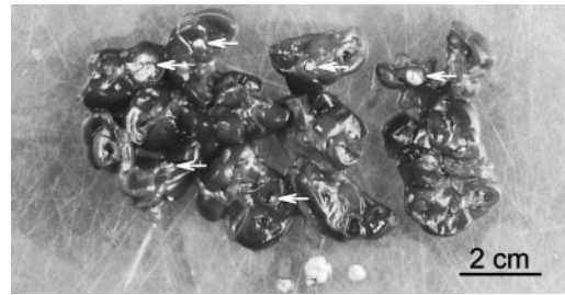
FIGURE 2. Left kidney of adult male river otter RAG-245, showing several stones (arrows) within the minor calyces.

Calculi were present in all minor calyces of the kidneys (Fig. 2). Calculi were removed, rinsed in distilled water, and air dried. A total of 4.9 g (3.2% of kidney