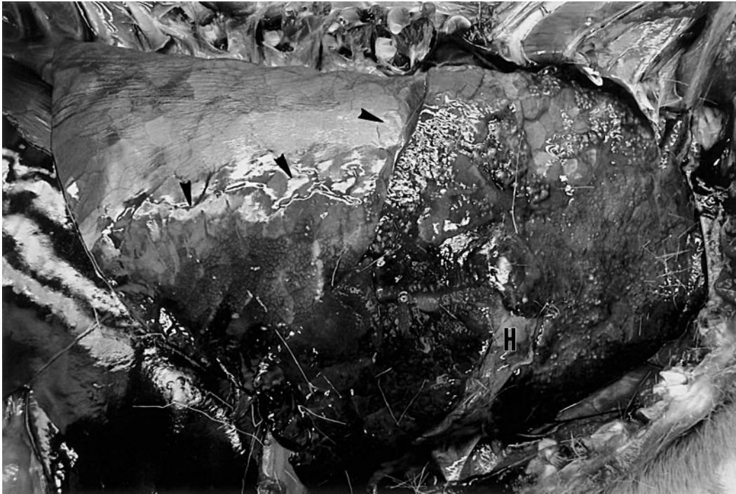
FIGURE 1. Severe bronchopneumonia in a white-tailed deer ( Odocoileus virginianus ) fawn. Note the line of demarcation (arrows) between the consolidated and non-consolidated lung. H = heart.

(Pullman, Washington, USA; BAV-5) and USDA (National Veterinary Services Laboratory, Reagents Office, Ames, Iowa, USA; BRSV, BVDV, IBRV, PI3V, and BRSV). Lung tissue from these four fawns was submitted for bacterial culture. Samples were placed on TSA II 5% sheep blood (Becton Dickinson, Sparks, Maryland, USA) at O 2 , 5% CO 2 and 15% CO 2 , and MacConkey II (Becton Dickinson) at O 2 , brain heart infusion broth (Becton Dickinson) at O 2 and Mycoplasma agar (Myco Plate, Vet Med Biological Media Services, UCD, Davis, California, USA) at 5% CO 2 . Plates and broth were incubated in a moist chamber at 37 C. Arcanobacterium pyogenes (high numbers) and Escherichia coli (low numbers) were recovered from all four deer after 24 hr of incubation. At 48 hr, Mycoplasma plates examined under an inverted microscope (10×) showed typical fried-egg colonies. The Mycoplasma organism was submitted to a reference laboratory (California Ani-