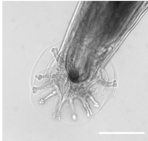
FIGURE 4. Ventral view of O. circumlitus male bursa. Bar = 2.5 cm.

served. Female and male voucher specimens were deposited in the U.S. National Parasite Collection, Beltsville, Maryland (accession number: USNPC# 95337).