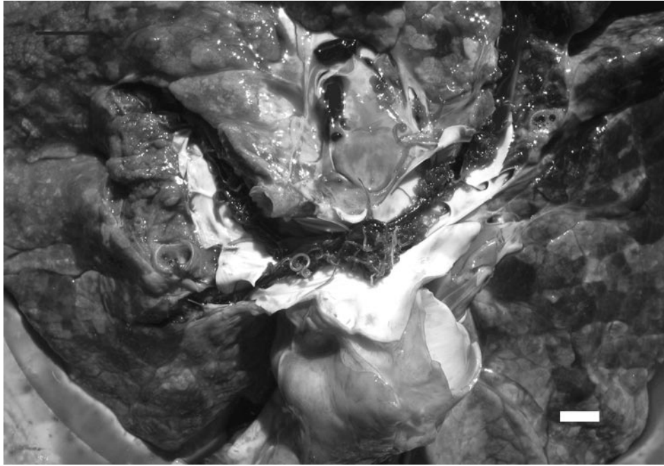
FIGURE 1. The dorsal surface of the lungs of a California seal lion infected with Otostrongylus circumlitus . Note the numerous nematodes in the lumen of the pulmonary artery. Bar = 2.0 cm.

malin, routinely processed for paraffin embedding, sectioned at 5 \mu\text{m} , and stained with hematoxylin and eosin (Luna, 1968). Histologic findings in the lungs included severe suppurative and necrotizing arteritis with vascular thrombosis, interstitial pneumonia, and large areas of pulmonary