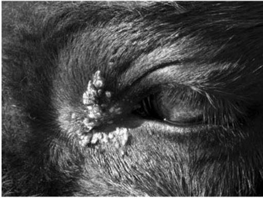
FIGURE 1. Papillomas at the medial canthus of the left eye of a European bison.

were found on this or any other bison, or even any other animal in the zoo. The bison enclosure of the Bussolegno Zoo adjoins the domestic cattle enclosure, but no papillomatous lesions were found there either. Nor did physical examination of the bison on their arrival at the Bukovské Vrchy Hills reveal any skin lesions. The keeper taking care of the bison during their stay at the acclimatization game preserve first noticed the papillomas at the eye of the one bison when it had been in the preserve for some (unspecified) time.