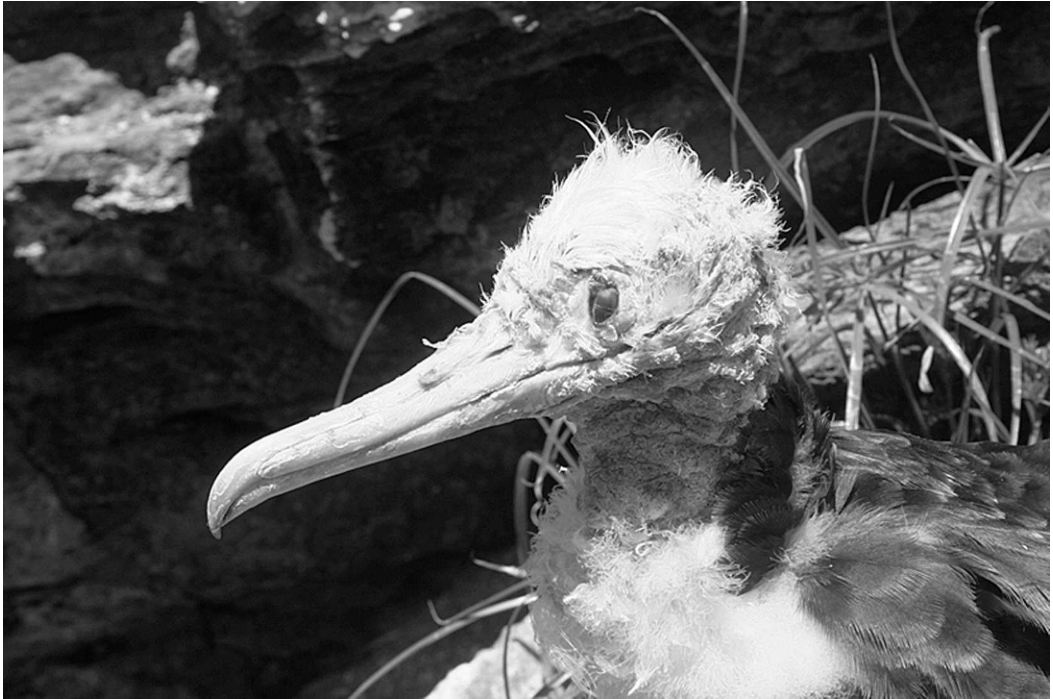
FIGURE 1. Skin lesions and cornea alteration in a Frigatebird chick.

maxima , Sterna eurygnatha , Sterna fuscata , Anous stolidus , and Larus atricilla ). In the following 2 wk, 33 more dead chicks were recorded, and 27 chicks had clinical signs. After 1 mo, 41 additional dead chicks were recorded. Through intense monitoring of nests, it was confirmed that symptoms were always lethal: no animal with clinical signs recovered.