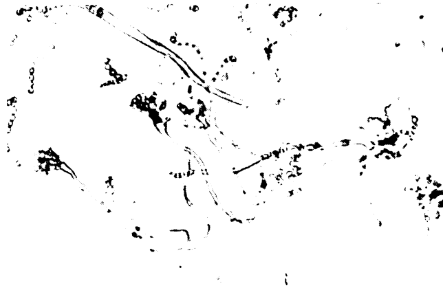
FIGURE 3. Fungal elements from a Sabouraud agar plate inoculated with material from lesions shown in Figures 1 and 2. Cotton blue-stained wet mount.