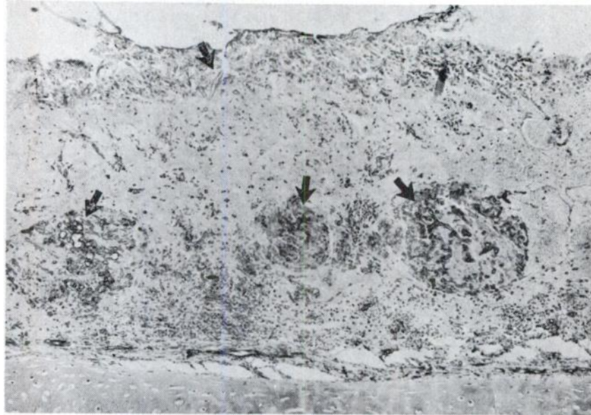
FIGURE 4. Trachea of a white-tiled deer with fungal hyphae (arrows) under the epithelium and in thrombi in sub-epithelial vessels. PAS stain.