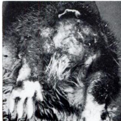
FIGURE 2. Tail region of squirrel showing serous exudate present after removal of scabs.