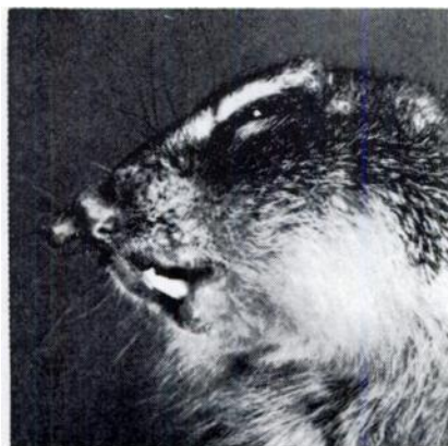
FIGURE 1. Thick crusted material on nose of squirrel.

In July, 1967, one of the squirrels was presented at the Ontario Veterinary College because of skin lesions which had been noted approximately two weeks earlier. The animal was euthanized and examined. Thick crusts of material which appeared to be keratinized skin were found on the nose and cheeks (Fig. 1). The scabs were tightly adherent and the underlying tissue was moist and hyperemic. There was erythema and alopecia of the hind legs and perineal region; the tail was a naked stump approximately 2 cm long (Fig. 2). Smears made from the serous exudate beneath the scabs were stained with Giemsa. Numerous long filaments which appeared to be dividing transversely and longitudinally to form coccoid bodies were observed (Fig. 3). This type of growth is considered to be diagnostic for Dermatophilus (Roberts, 1967, Vet. Bull. 37 (8): 513). In stained tissue sections the organisms appeared to be restricted to the epidermis, in which there were areas of hyperkeratosis and micro-