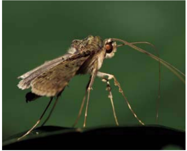
An unidentified pyralid moth found on the RAP survey.