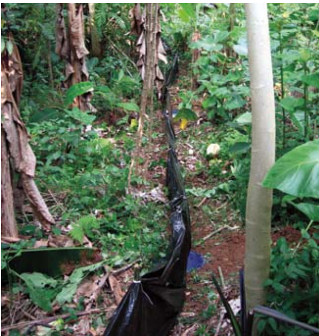
A drift fence and pitfall trap setup for capturing small amphibians, reptiles, and mammals.