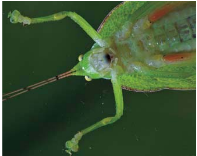
Mustius afzelii was found in both forest reserves.