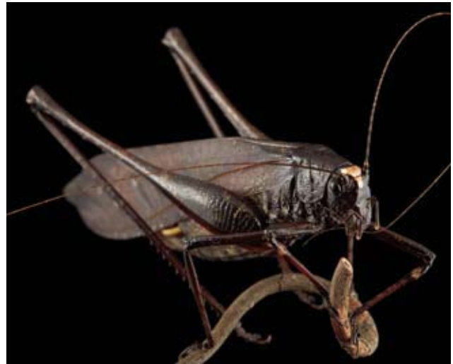
Afromecopoda frontalis was found in both forest reserves.