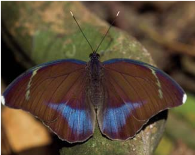
Euphaedra harpalyce , a nymphalid butterfly, is a widely distributed forest species that was found in both forest reserves.