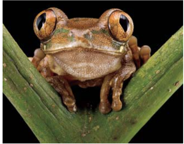
Although it is clearly a forest-dwelling species, very little is known about the ecology and natural history of the Near Threatened (IUCN, 2008) Tai Forest Treefrog ( Leptopelis occidentalis ).