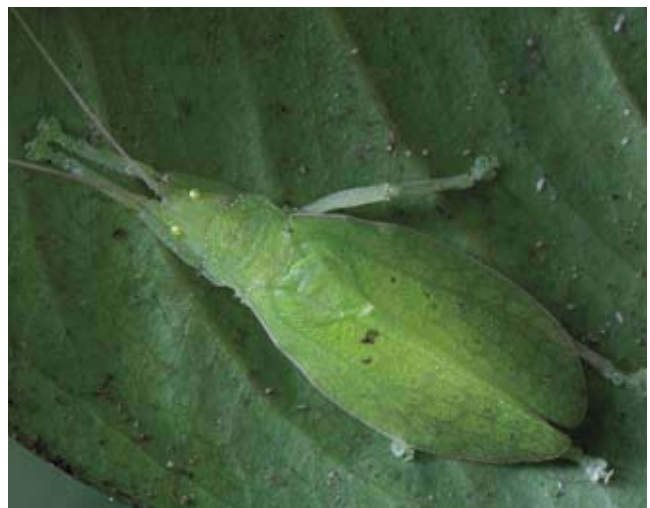
Tomias gerriesmithae , a new species to science that was discovered on this RAP survey.