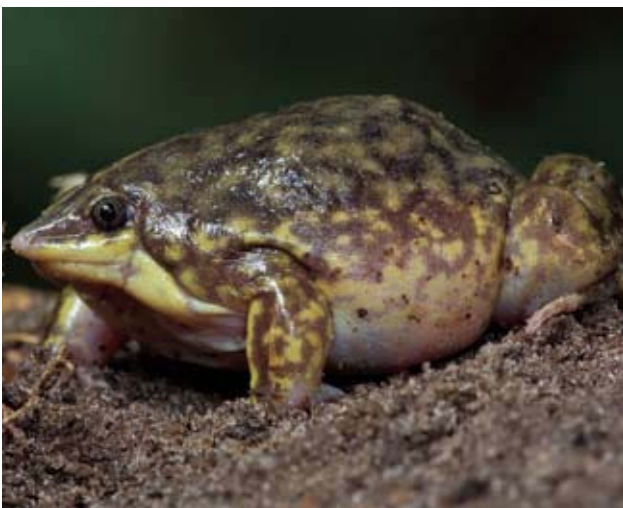
Hemissus marmoratus was found in the Mamang River Forest Reserve.