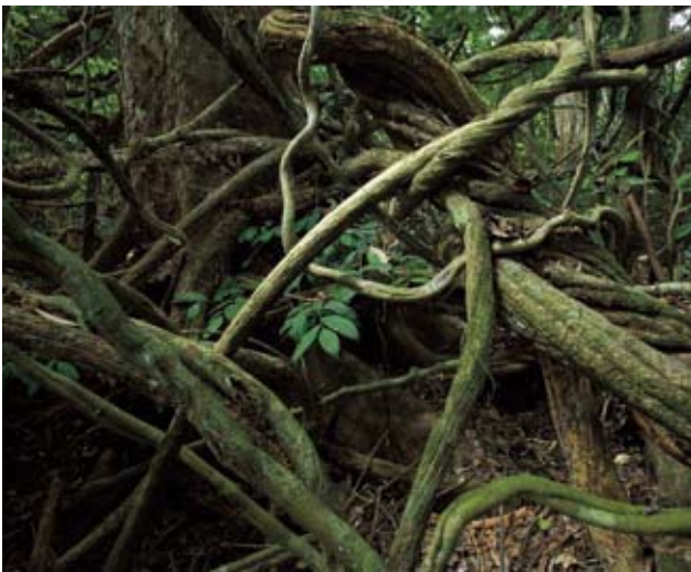
A vine tangle, a common vegetation feature within the Mamang River Forest Reserve.