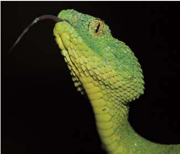
This viper species ( Atheris chlorechis ) was found in the forest of the Mamang River Forest Reserve.