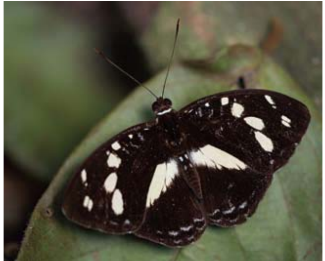
Aterica galene , a nymphalid butterfly, is a widely distributed forest species.