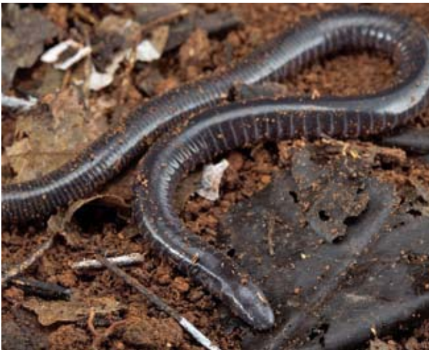
Caecilians ( Geotrypetes seraphini ) are legless, snake-like amphibians that are not well known because they are largely fossorial and very secretive.