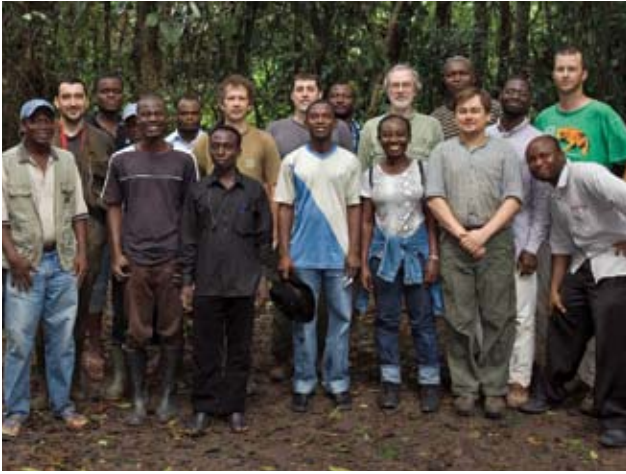
Participants of the RAP survey.