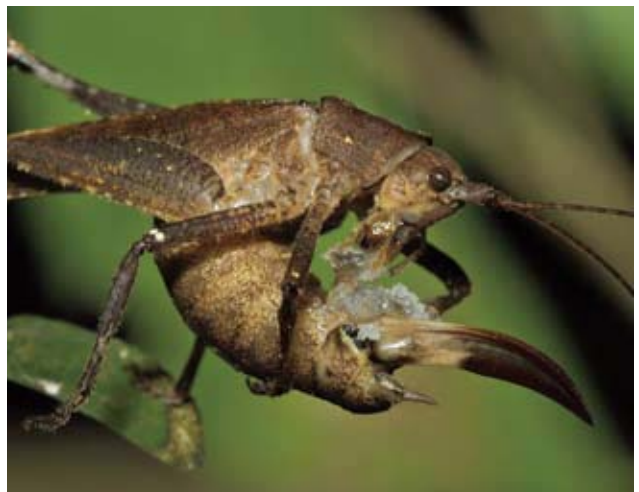
A female Sylvan katydid ( Adapantus bardus ) eating the spermatophore left by a male that mated with her.