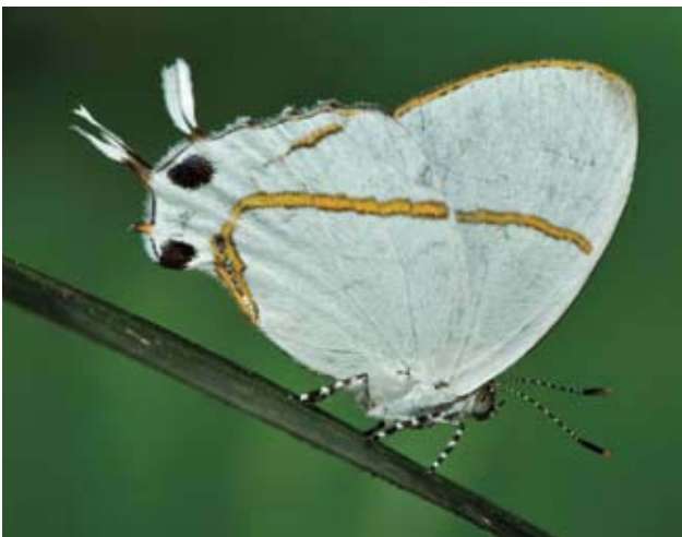
Oxyides faunus , a lycaenid butterfly that is found in moist evergreen forests.