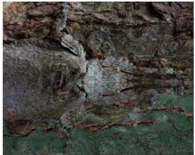
Cymatomera chopardi , a very rare katydid species with only two specimens known, was recorded for the first time in Ghana during the RAP survey.