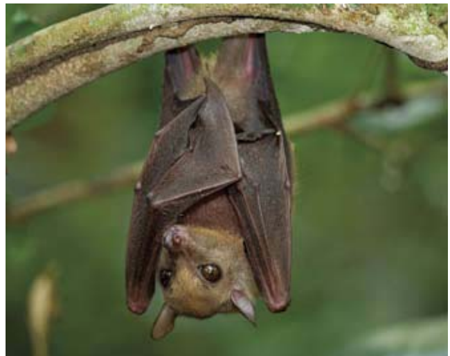
Only four specimens of a single forest-dwelling bat species ( Myonycteris torquata ) were recorded within the forest reserves, most likely a result of weather conditions during surveys.