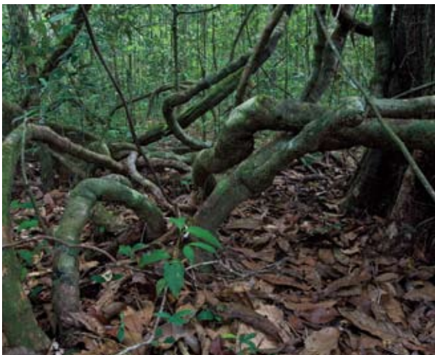
Forest floor of a typical, annually inundated forest along the Kamao River