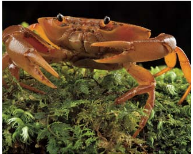
Freshwater Crab ( Fredius sp.) can sometimes be found outside of water, foraging on the forest floor