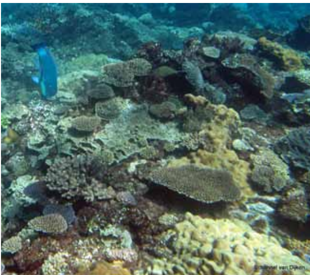
Récif. Reef.