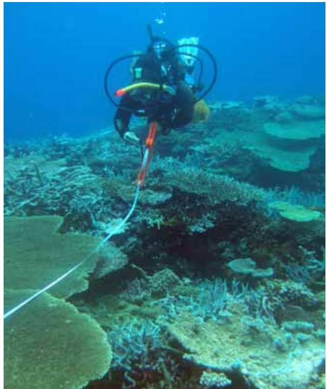
Transect benthiques sur le récif. Reef transect.