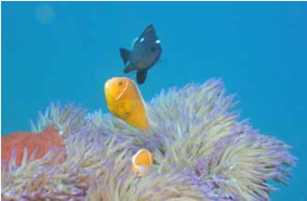
Amphiprion peridraion , Poisson clown. Clownfish.