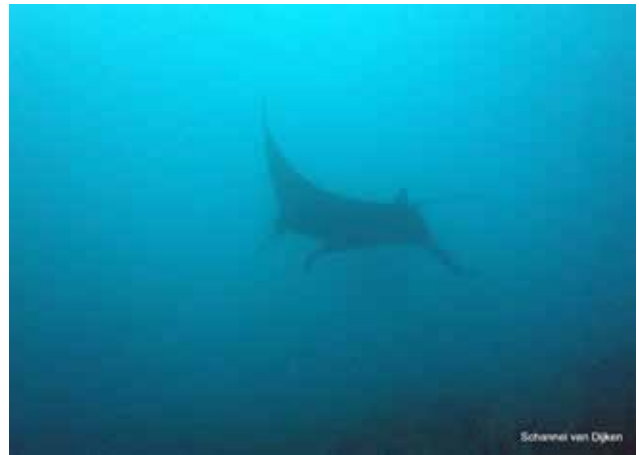
Manta birostris, raie manta. Manta ray.