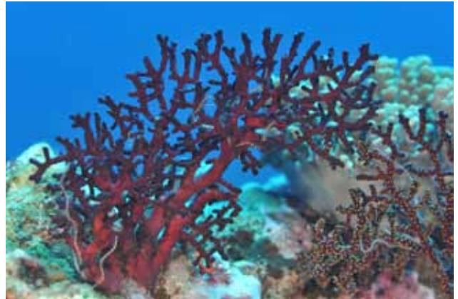
Siphonogorgia sp., Corail mou. Soft coral.