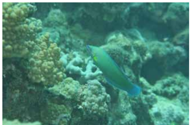
Halicoeres richmondi , Poisson labre, Wrasse. Richmond's Wrasse.