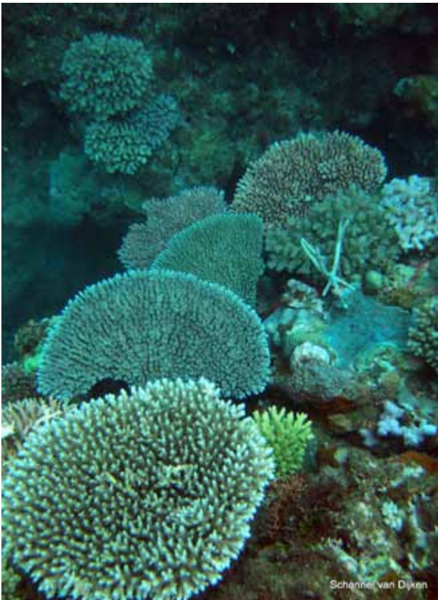
Corail dur. Hard coral.