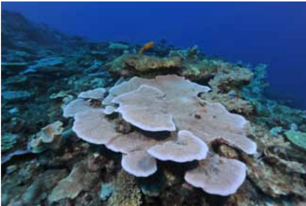
Montipora sp., Corail dur. Hard coral.