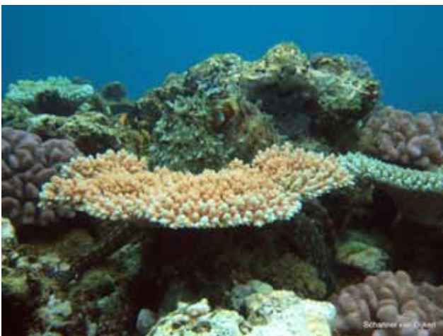
Acropora sp.