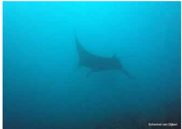
Manta birostris, raie manta. Manta ray.