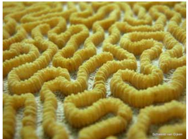
Platygyra daedalea , Corail dur. Hard coral.