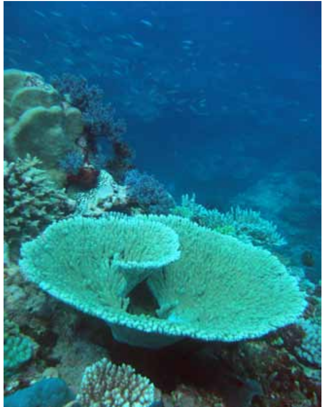
Acropora sp., Corail dur. Hard coral.