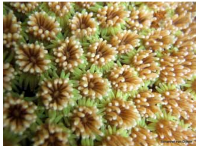
Galaxea sp.