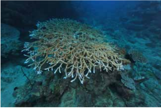
Acropora sp., Corail dur. Hard coral.