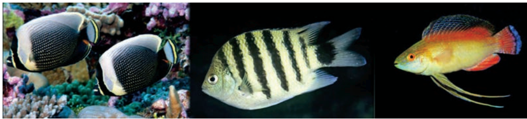
Plate 3.17. New distributional records included (from left to right): Chaetodon reticulatus , Abudedefduf lorentzi , and Cirrhilabrus pylei .