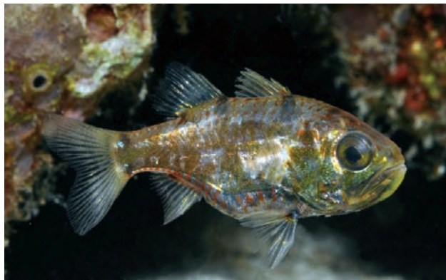
Plate 3.9. Siphamia sp., 3.5 cm total length.