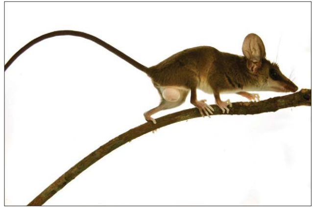
Figure 11.1. Delicate slender opossum ( Marmosops parvidens ) caught at the Upper Palameu site by Piotr Naskrecki.

bat, Lophostoma silvicolum [Figure 11.5]). By contrast, the 3 species of opossums were caught only once, each at one of the 3 different sites. For rats and mice, the Guianan terrestrial spiny rat ( Proechimys guyanensis ) was the most common with 5 captures but it was caught at only Site 2 in