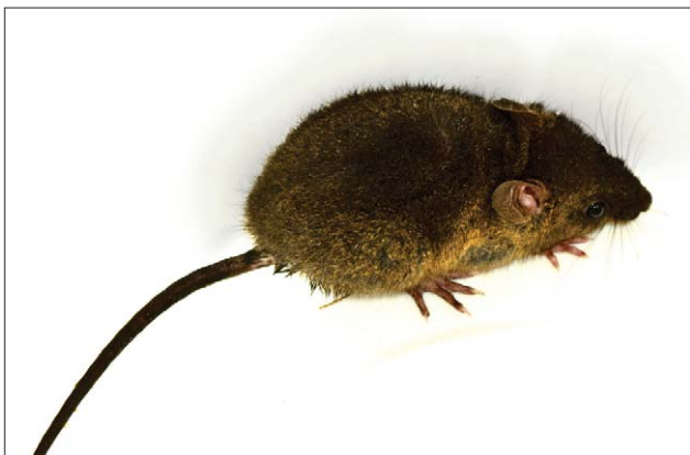
Figure 11.6. Water rat ( Nectomys rattus ) caught at the Grensgebergte site.

and snakes. The only rat that was caught at all 3 sites was the arboreal rice rat Oecomys auyantepui . The water rat Nectomys rattus (Figure 11.6) was also captured 3 times, but all were from the Grensgebergte Mountains site.