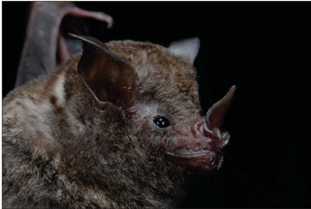
Figure 11.4. Seba's short-tailed fruit bat ( Carollia perspicillata ).

the Grensgebergte Mountains. The closely related Cuvier's terrestrial spiny rat ( P. cuvieri ) was one of the next commonest species with 3 individuals caught. These large rats (ca. 500 g) are prey for many top-level predators such as cats