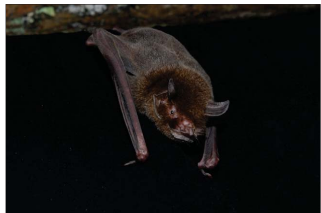
Figure 11.3. Common moustached bat ( Pteronotus parnellii ).