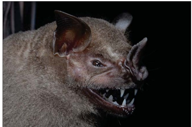
Figure 11.2. Larger fruit-eating bat ( Artibeus planirostris ).