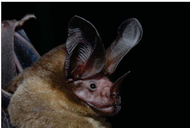
Figure 11.5. Round-eared bat ( Lophostoma silvicolum ).