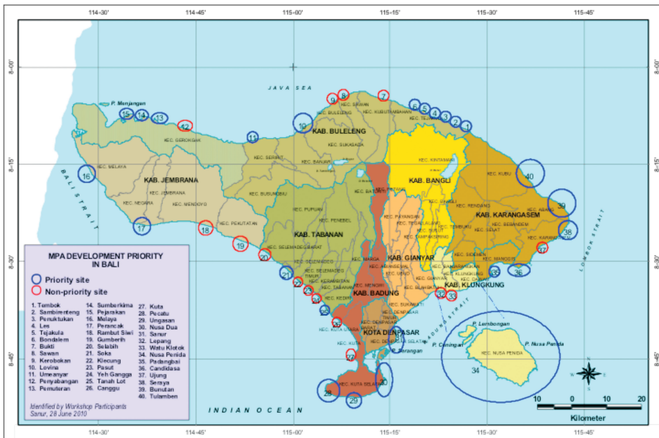
Figure 1.1. Priority sites to be developed as MPAs in Bali (the result of a stakeholder workshop in June 2010)