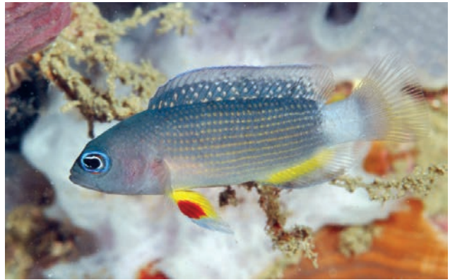
Plate 3.7. Manonichthys sp., 3.5 cm total length.