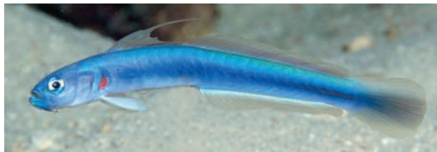
Plate 3.16. Ptereleotris rubristigma , 10 cm total length.