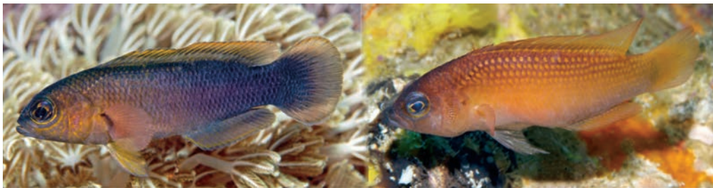
Plate 3.8. Two new Pseudochromis from Bali and Nusa Penida, 7 cm total length.