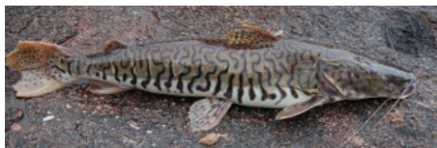
Figure 8.3. Two large fish species of the Middle Palumeu River. A. Pacu Tometes lebaili (Serrasalminae). B. Tiger catfish Pseudoplatystoma tigrinum (Pimelodidae).