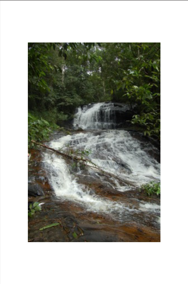
Figure 8.1. A 50-m high waterfall in a right tributary of Upper Palumeu River was the collection site of a diverse fish fauna including many interesting characoids and loricariid and trichomycterid catfishes that are either new to science or collected for the first time in Suriname.