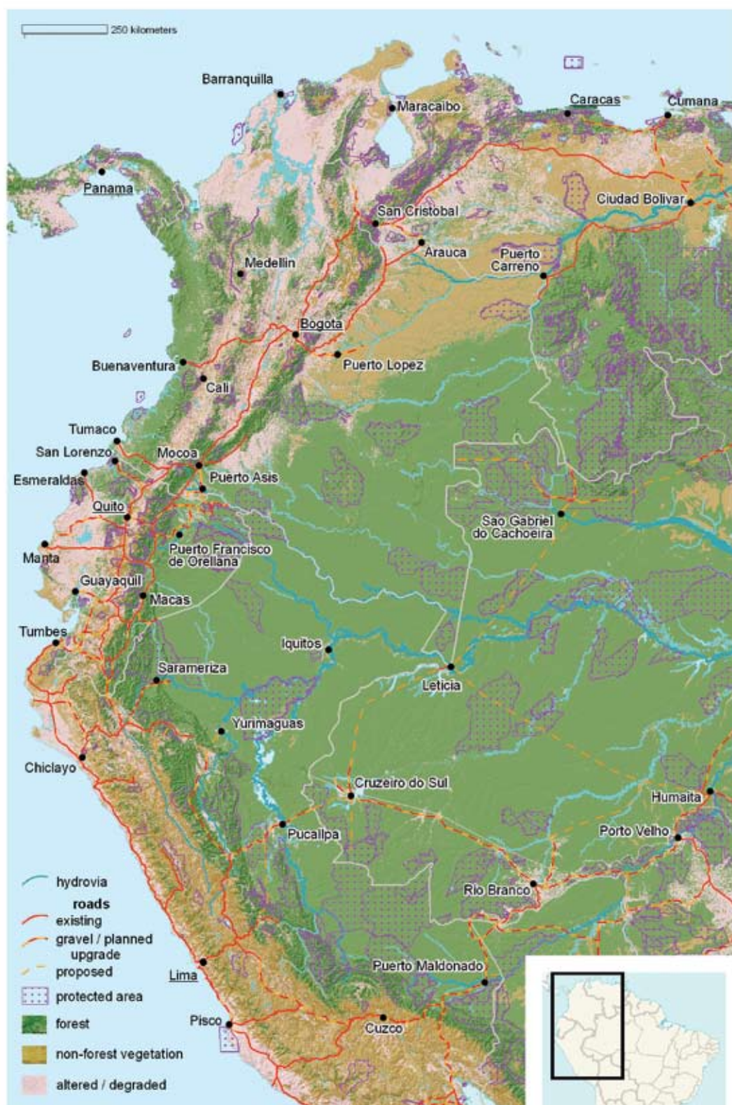
Figure A.1. IIRSA investments in the northwest Amazon and on the Andean piedmont will link the waterways of Amazonian tributaries (Putumayo, Napo, Mara  n, and Ucuyali) via trans-Andean highways to the Pacific Coast. However, these East - West highways will also create a piedmont corridor that stretches from Pucallpa in central Peru to the Putumayo in Colombia. Development and deforestation along that corridor will isolate the Andean and Amazonian biota and limit the ability of numerous species to adapt to future climate change.