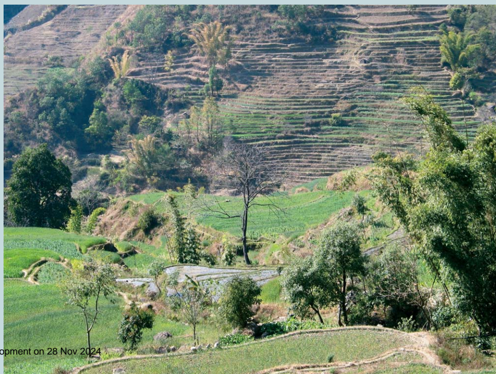
FIGURE 2 On-farm agroforestry and intercropping trials.

This environmental training program has not been limited to government bureaus. In order to foster ongoing community support and understanding, we have worked with local partners to establish community environmental education programs targeted at elementary and secondary schools, as well as training for teachers in environmental education. Village workshops and information exchanges were held regularly, and students and their families attended training sessions at local