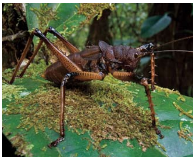
Lobster Katydid ( Panoploscelis specularis ), one of the largest katydids of the Neotropics