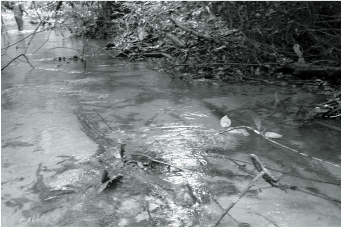
GR-AM-03: Acarai creek