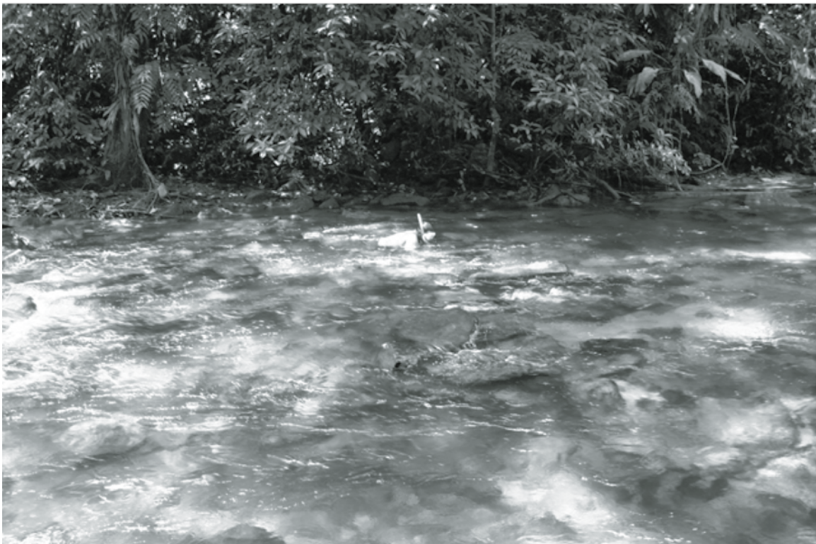
GR-AM-04: Acarai creek