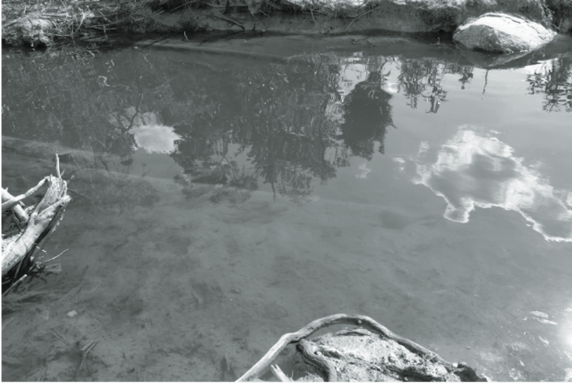
GR-MA-02: Downstream of bathing area at the creek in Masakenari