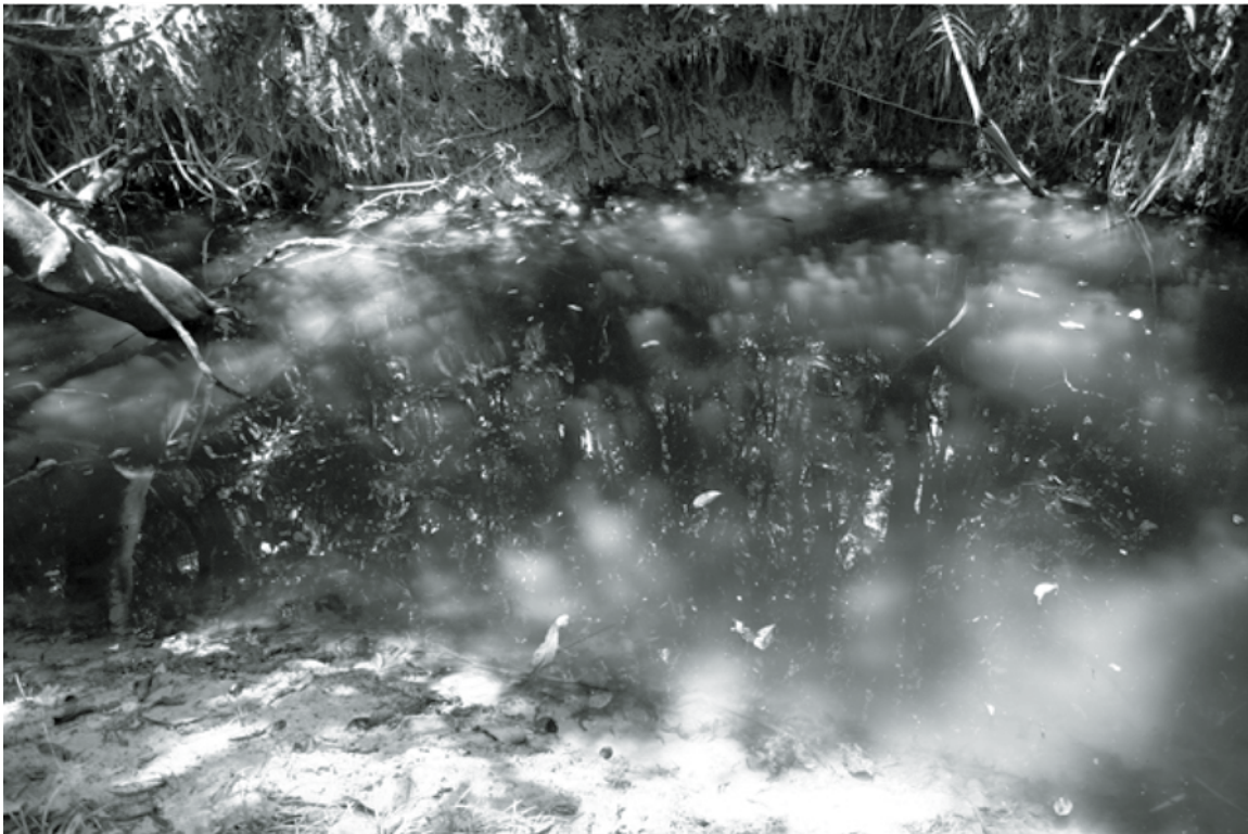
GR-SR-04: Creek off of the Sipu River