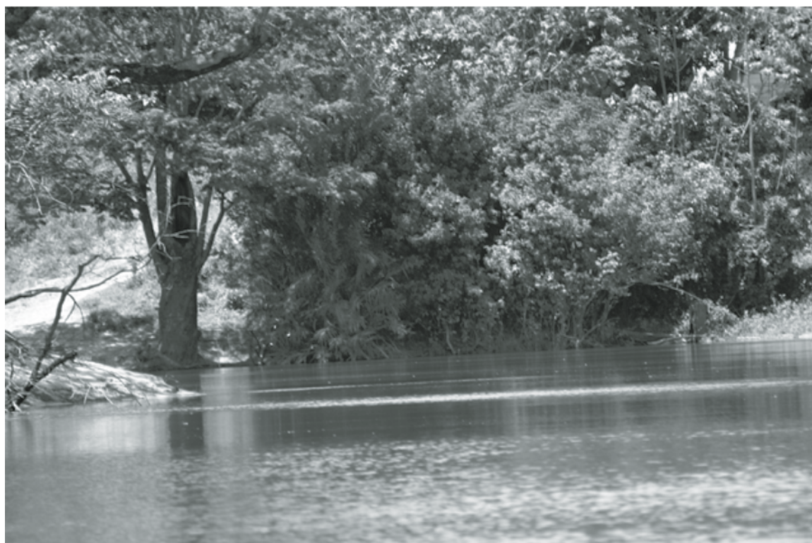
GR-ER-01: Akuthopono Landing