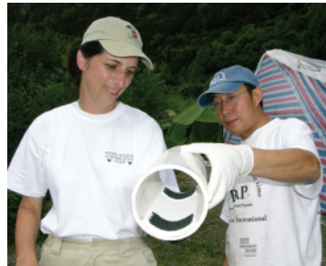
Discussing sampling protocol for small mammals