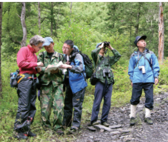
RAP scientists training reserve staff on birding