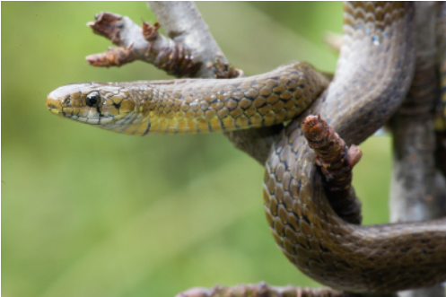
Upper-labial grooved-neck keelback ( Rhabdophis pentasupralabialis )