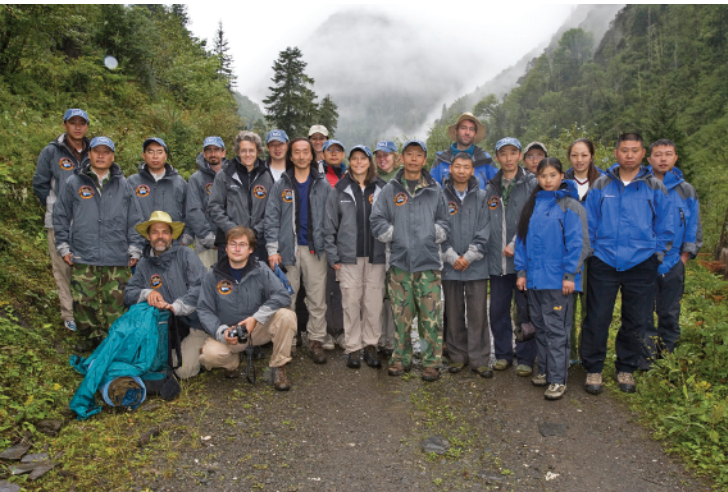
RAP group photo (part of the participants)