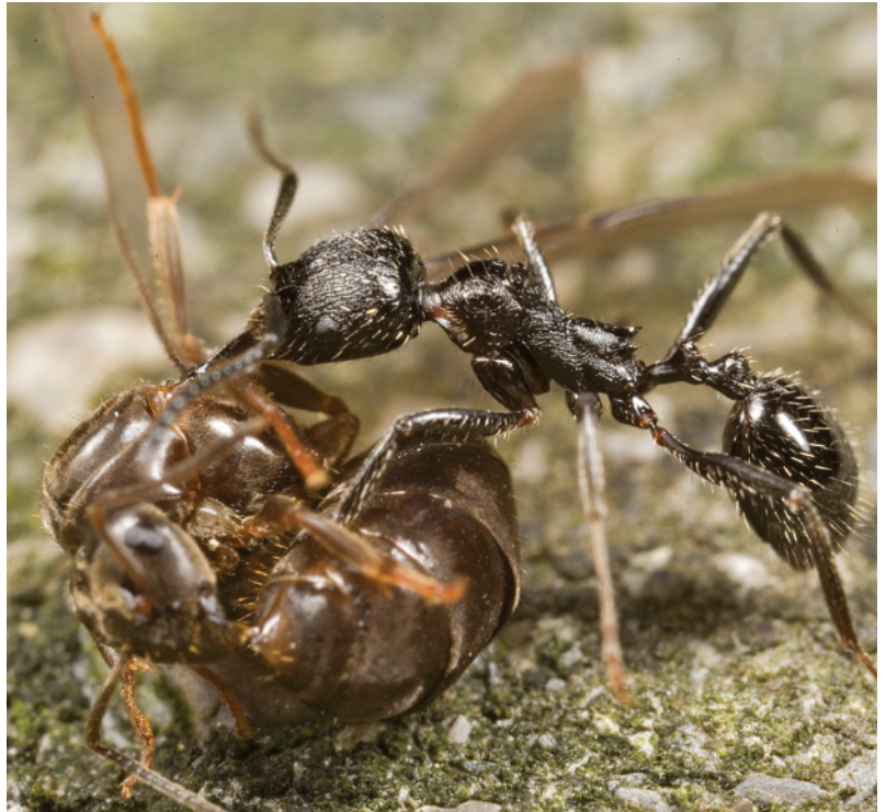
Aphaenogaster ant attacking another ant species