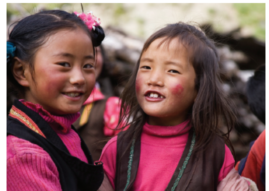
Tibetan girls at Decha village