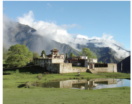
Survey site 1 Dingguoshan monastery