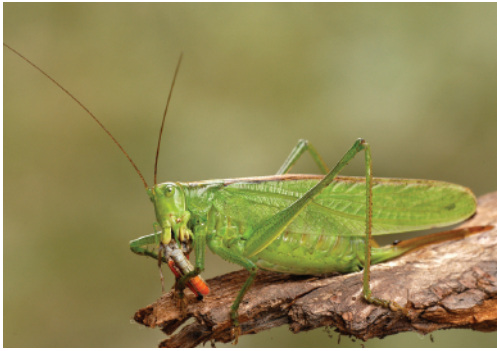
Tettigonia chinensis