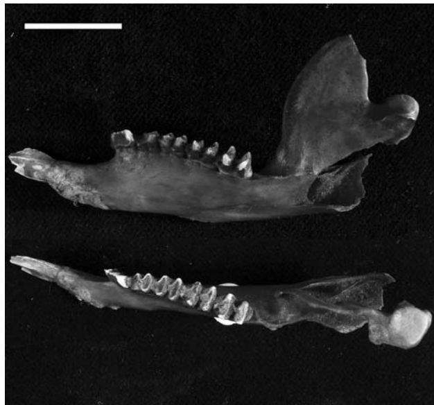
Figure 4.1. Trophy jaw of Thylogale calabyi discovered in the village of Suyan in the Kaijende Highlands. It represents only the third documented site of occurrence for this species. Scale Bar = 25 mm.

Thylogale calabyi is a little-known, medium-sized wallaby (probably 2–4 kg) previously recorded in the literature only from subalpine grassland habitats ( \geq ca. 2,800 m elevation) on two peaks in Papua New Guinea — Mt. Giluwe in Southern Highlands Province and Mt. Albert Edward in Central Province (Flannery 1992). The presence of T. calabyi in the Kaijende Highlands is documented by a single trophy jaw collected in the village of Suyan (Figure 4.1). This identification has been confirmed by a direct comparison of the trophy jaw with the holotype of T. calabyi at AM and is only the third documented site of occurrence for the species. Ken Aplin (in litt.) informs me that T. calabyi is also represented