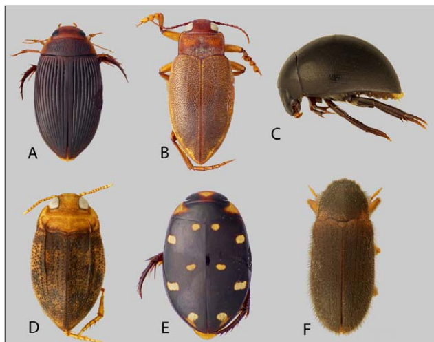
Figure 4.3. Selected habitus images of aquatic beetle taxa collected in the Grensgebergte and Kasikasima regions. A) Copelatus sp., B) Vatellus grandis , C) Derallus sp., D.) Anodocheilus sp., E) Platynectes sp., F) Dryops sp.

There were almost 10% more species collected during this RAP than the previous one around Kwamalasamutu, on which 144 species were recorded (Short and Kadosoe 2011). This is striking because far fewer overall specimens were collected (c. 2500 vs. >4000), in large part because of reduced manpower (one collector vs. two for Kwamalasamutu). Amazingly, more than 40% of the species (69) collected during this RAP were not collected at Kwamalasamutu. Some species that were extremely abundant in Kwamalasamutu (e.g. Enochrus sp. 1, Notomicrus , Thermonectus ) were generally rare on this RAP. In some cases, such as with the majority of seepage taxa, this can be attributed to availability of suitable habitat. In other cases, it may be due to seasonality