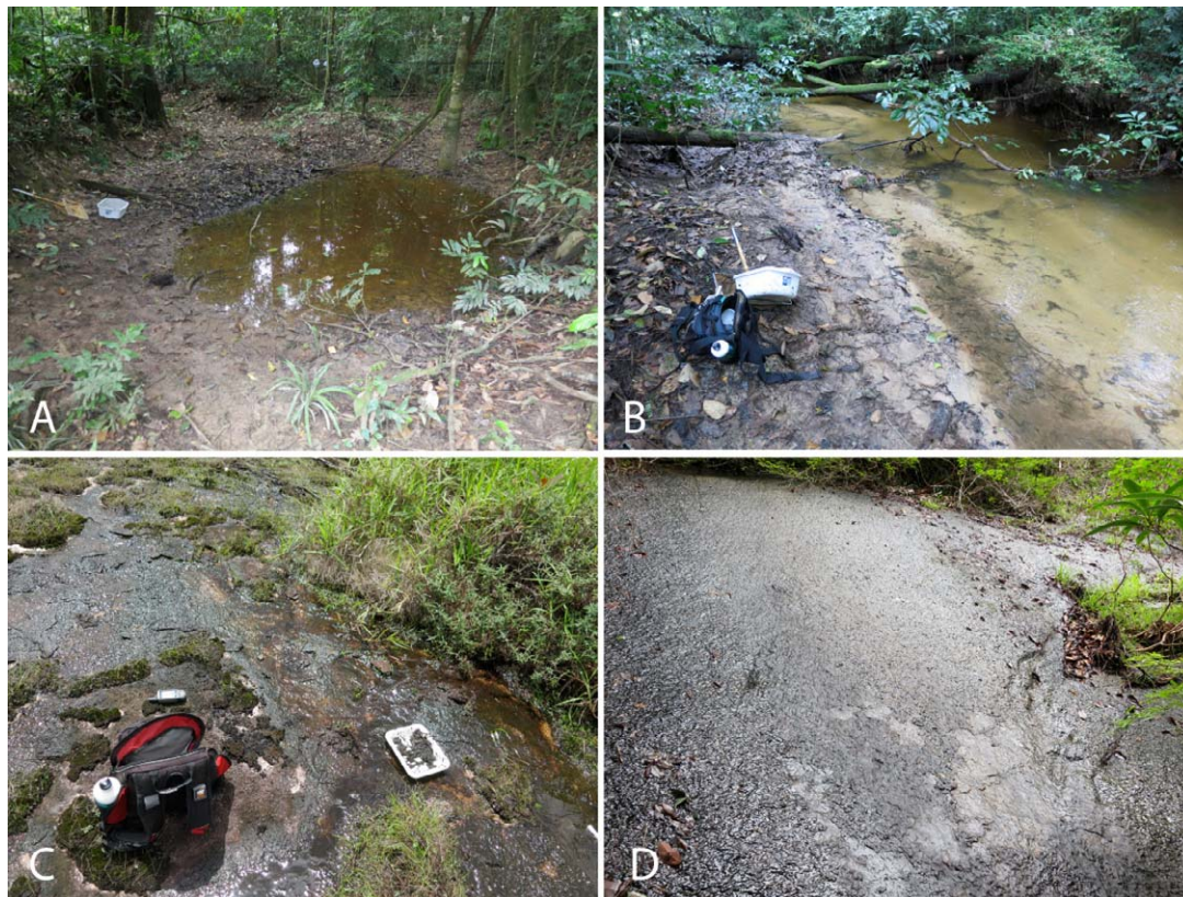
Figure 4.1. Selected collecting event photographs, with field numbers given in brackets. A) Camp 1, detrital pool along floodplain of small upper Palumeu tributary [SR12-0311-01A], B) Camp 1, tributary of the upper Palumeu [SR12-0314-01A], C) Camp 2, typical seepage habitat on the Grensgebergte summit [SR12-0312-01A], D) Camp 4, large flowing seepage near the base of Kasikasima [SR12-0324-01C].

Most collecting was done along a cut trail south that continued to the Brazilian border, and in the immediate (<1 km) vicinity of basecamp. Along the trail a few kilometers south