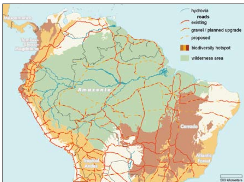
Figure 1.2. Principal IIRSA highway corridors and hydrovias are shown in the context of the Amazon Wilderness Area and the Cerrado and Andes Biodiversity Hotspots. Conservation International organizes priority action in these regions.