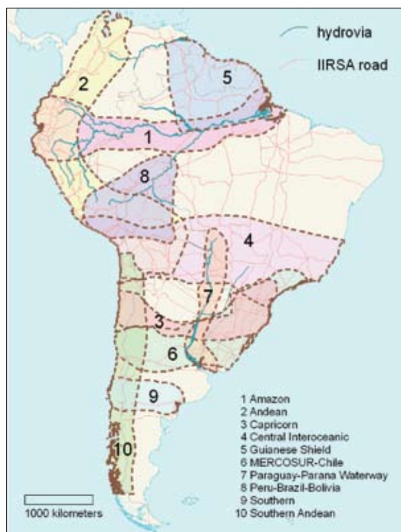
Figure 1.1. IIRSA is composed of ten hubs that incorporate investments in modern paved highways, railroads, waterways, and grids. The upgraded road networks will span the Amazon, while waterways (hydrovias in IIRSA terminology) will open up vast areas of the western Amazon to commerce and development (map modified from IDB 2006).

IIRSA involves all the countries of South America and was created to promote growth and development by investing in the physical integration of three strategic economic sectors: transportation, energy, and telecommunications. Although IIRSA is not a free trade agreement, it addresses regulatory issues that are barriers to the economic and social exchange among the nations. IIRSA promotes common industrial standards and communication protocols, while facilitating border crossings for rail, maritime, and airline transport. IIRSA also sponsors meetings and studies to promote commerce, and it facilitates technological exchange, integration of markets, and standardization of regulations (IDB 2006). However, IIRSA's most important investments are focused on improving the physical infrastructure of transportation. IIRSA projects are organized within one of ten integration hubs ( ejes in Spanish and eixos in Portuguese), each with several corridors composed of highways, hydrovias, 1 and railroads, as well as electrical grids and pipelines (Figure 1.1). IIRSA is not a funding agency; rather, it is a coordinating mechanism among the governments and the multilateral institutions that are responsible for financing most of the public works investments in South America. IIRSA is governed by an Executive Steering Committee (CDE) and a Technical Coordinating Committee (CCT). The CDE