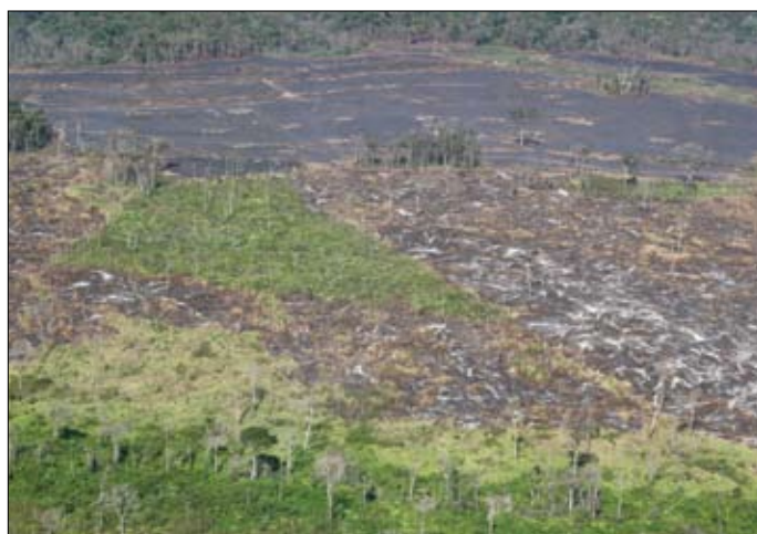
Figure 1.7. A Business as Usual Scenario assumes that existing patterns of natural resource exploitation would continue, leading to landscapes dominated by low intensity agriculture and degraded forests. Poor governance and unregulated markets would lead to boom and bust cycles that inhibit long-term investment in social services, and the region would be characterized by entrenched poverty.

Similarly, the widespread adoption of fish farming degrades some hydrological resources due to the release of effluents from production ponds.