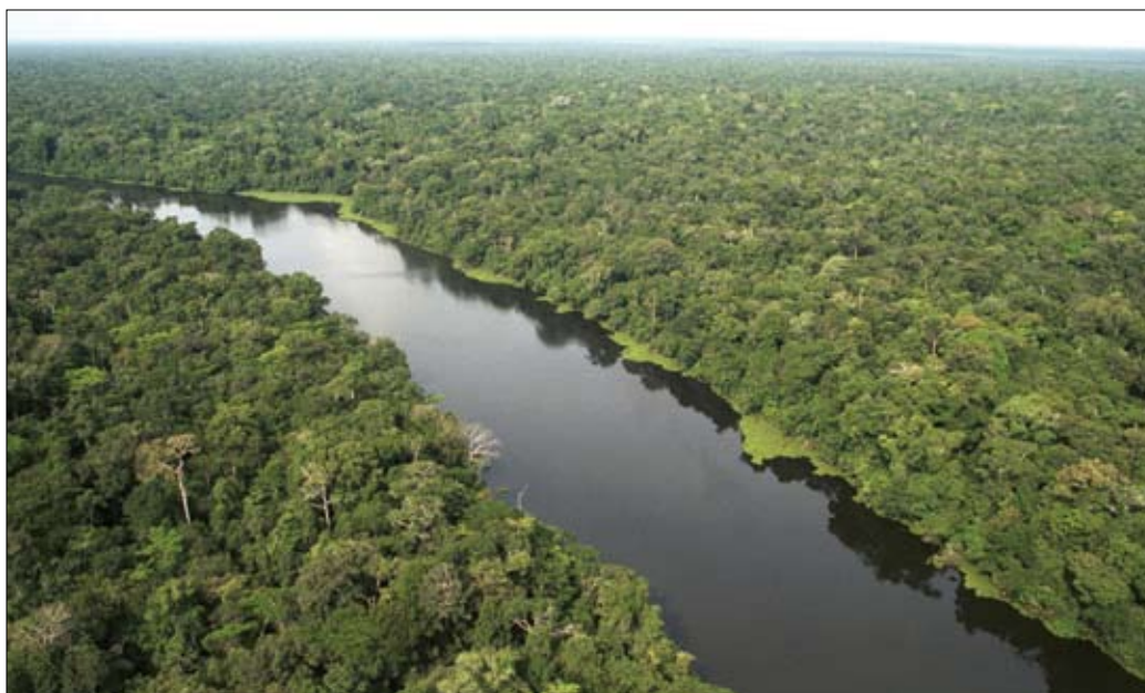
Figure 1.6. A Utopian Scenario would require an international agreement that compensates Amazonian countries for reducing carbon emissions caused by deforestation. Payments for ecosystem services would be used to fund health and education, and to subsidize production that avoids deforestation and forest degradation.