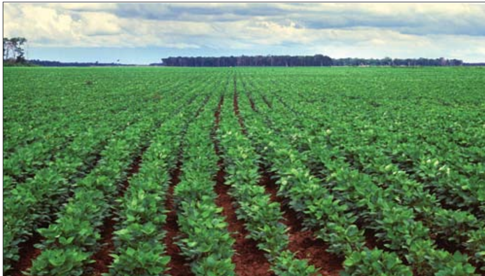
Figure 1.5. In a Utilitarian Scenario, an infusion of private capital would convert the Amazon into an agro-industrial powerhouse that provides the planet with food, fiber, and biofuels, while allowing for sustainable economic growth and social equity. Amazonian countries would develop technological solutions to overcome agricultural challenges such as soil infertility and weed control.

Because of the adverse impacts associated with similar investments in the past, IIRSA investments in infrastructure are viewed by many observers as a threat to the natural ecosystems of the Amazon and surrounding regions. Fortunately, most of the financial organizations involved with IIRSA have relatively high standards for environmental and social evaluation and usually condition loans on the implementation of environmental and social action plans. 5 Nonetheless, because infrastructure projects are being evaluated individually, 6 they fail to consider how the combination of projects and external forces such as global markets, transfrontier migration, or climate change might act synergistically to cause unforeseen effects. 7 The academic community has provided valuable insight into the potential future impacts and ample justification that a comprehensive evaluation procedure should be required for both IIRSA and PPA (Laurance et al. 2001, 2004, Nepstad et al. 2001, da Silva et al. 2005, Fearnside 2006b).