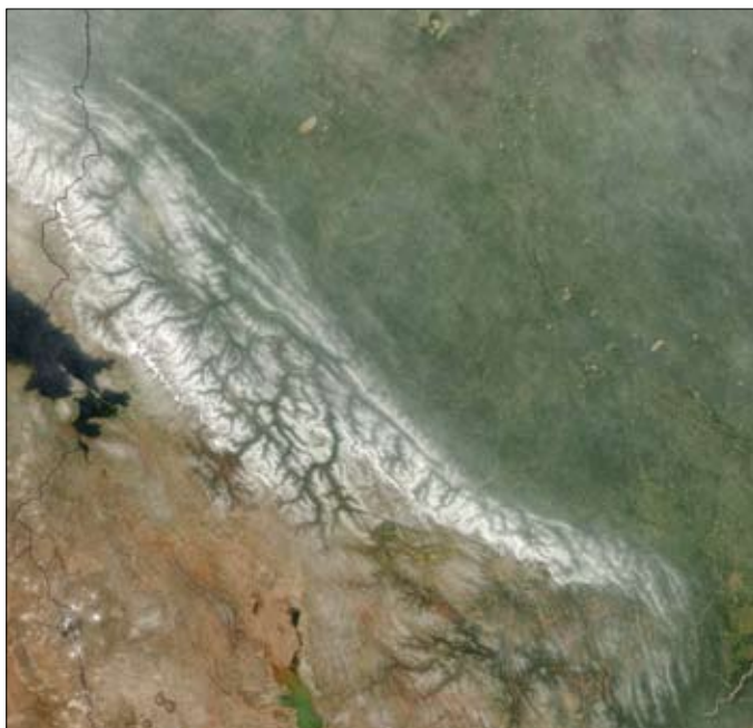
Figure 3.1. Cloud forests are unique habitats that vary according to local topography and wind flow; consequently, they are inherently fragmented and spatially complex as shown by this composite image of the Andean foothills in Bolivia. This image is derived from MODIS images taken at approximately 10:30 and 13:30 local time from the NASA Terra and Aqua satellites. White areas are those with frequent cloud cover.

thus, habitat diversity and species turnover are prominent attributes of this ecosystem.