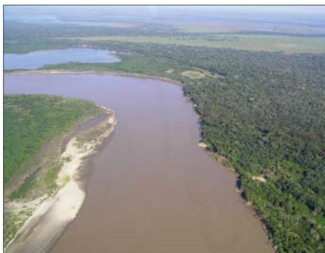
Figure 3.6. The inundated forests of the Amazon are strategically important for biodiversity conservation: (a) Igapo forest near Manaus is home to plant and animal species adapted to the acidic conditions of black water rivers; (b) Varzea forests have muddy, nutrient-laden waters and are among the most productive wetlands in the world (©CI and Tim Killeen/CI).