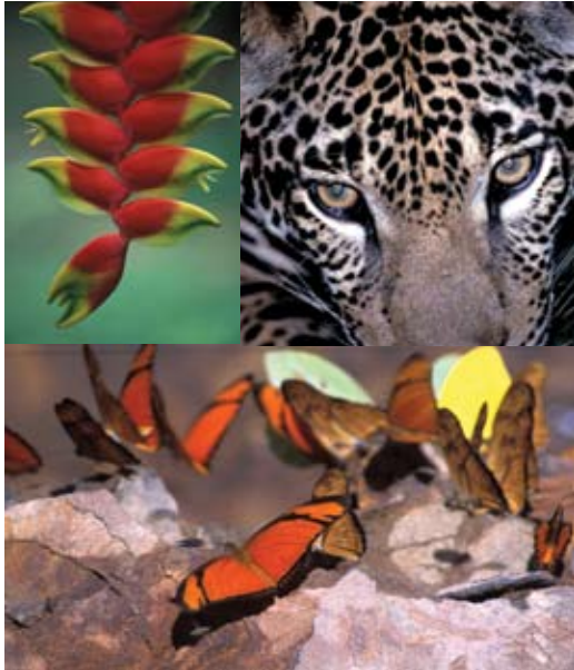
The Amazon, Andes and Cerrado are among the richest and most diverse regions of the planet.

Collectively and individually, IIRSA projects represent an enormous threat to the conservation of the biodiversity of the South American continent. All but one of the ten IIRSA corridors intersects with a Biodiversity Hotspot (Andes, Cerrado, Atlantic Coastal Rainforest) or Wilderness Area (Amazon, Pantanal, Gran Chaco, Caatinga). The IIRSA highway corridors planned for Bolivia, Ecuador, and Peru, the Arco Norte in the Guayana Shield region, and the PPA investments in the Brazilian Amazon are particularly worrisome because they will radically increase access to wilderness areas with very high levels of biological endemism. IIRSA will expose the western Amazon and the Andean foothills to potent global and regional economic forces, and the region's interconnected ecosystems will be inalterably changed. Climate change and geological history have left their mark on today's ecosystems and their species. The distribution of biodiversity is radically different in each of the region's major biomes due to the distinct physical attributes of mountains versus lowlands, and terrestrial versus aquatic ecosystems. Consequently, IIRSA and other development phenomena will have variable impacts across the Amazon, Andes, and the Cerrado biomes. Designing mitigation programs and conservation strategies must be predicated on a thorough understanding of the regional nature of biodiversity.