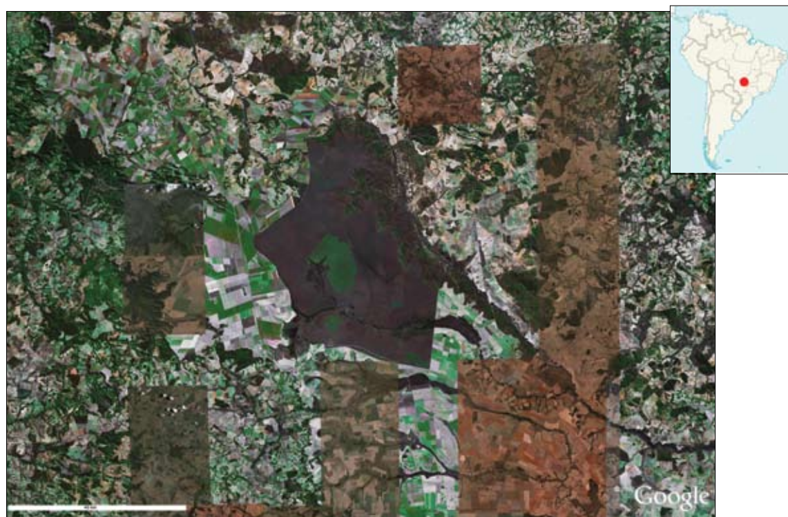
Figure 3.5. Emas National Park is an island of native habitat surrounded by farmland in the Cerrado. Gallery forests along rivers and scattered remnants of native habitat provide opportunities for a regional conservation strategy.

IIRSA and PPA investments will accelerate habitat degradation in most, if not all, of the extra-Amazonian ecosystems. The Cerrado Biodiversity Hotspot is the most endangered due largely to its suitability for mechanized agriculture. Although the Federal Government of Brazil makes repeated commitments to conserve the Amazon, similar actions to conserve in the Cerrado region are weighed against national priorities to expand agricultural production (Figure 3.5). Thus, although the Amazon ecosystem faces extensive degradation and fragmentation due to IIRSA investments over the medium term, the Cerrado faces virtual annihilation over the next half century (Machado et al. 2007). Considering the advanced state of the destruction of this biome, protected area creation should be part of any strategy that seeks to mitigate the effects of the PPA's investments in modern highways. The Brazilian forest code requires that 20 percent of private properties be left as native habitat within the Cerrado biome. These efforts to conserve gallery forests within private lands could significantly