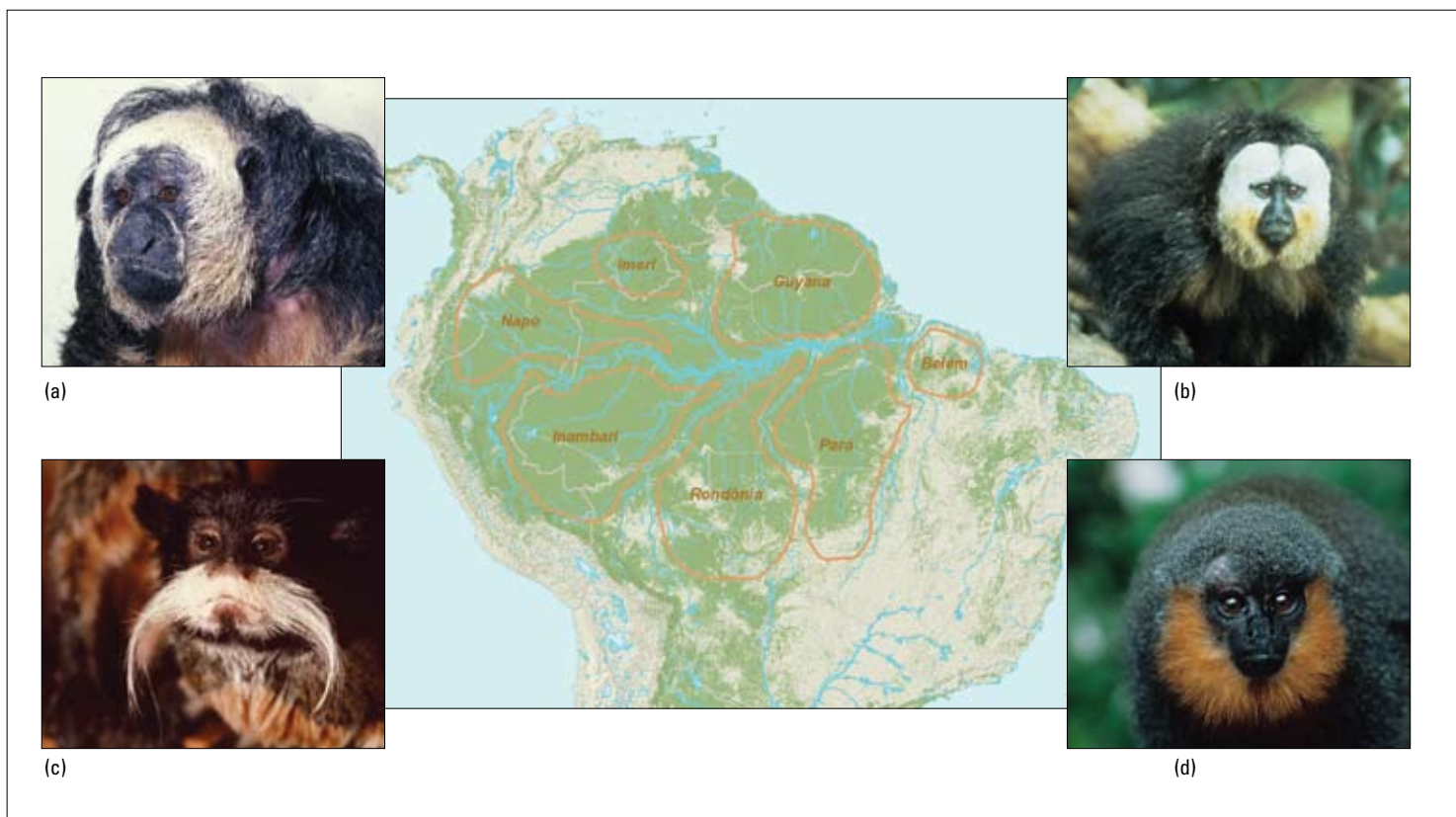
Figure 3.3. The Amazon has different biogeographic regions, each characterized by endemic vertebrates: (a) Equatorial saki ( Pithecia aequatorialis ) is endemic to the Napo region in Ecuador and northern Peru; (b) White-faced saki ( Pithecia pithecia ) is endemic to the Guiana region; (c) Emperor tamarin ( Saguinus imperator ), is endemic to the Inambari region and (d) Prince Bernhard's titi monkey ( Callicebus bernhardi ) is endemic to a restricted area in the Rondônia region. Deforestation has already severely affected the eastern and southern regions, while IIRSA investments will impact the Inambari and Napo regions.