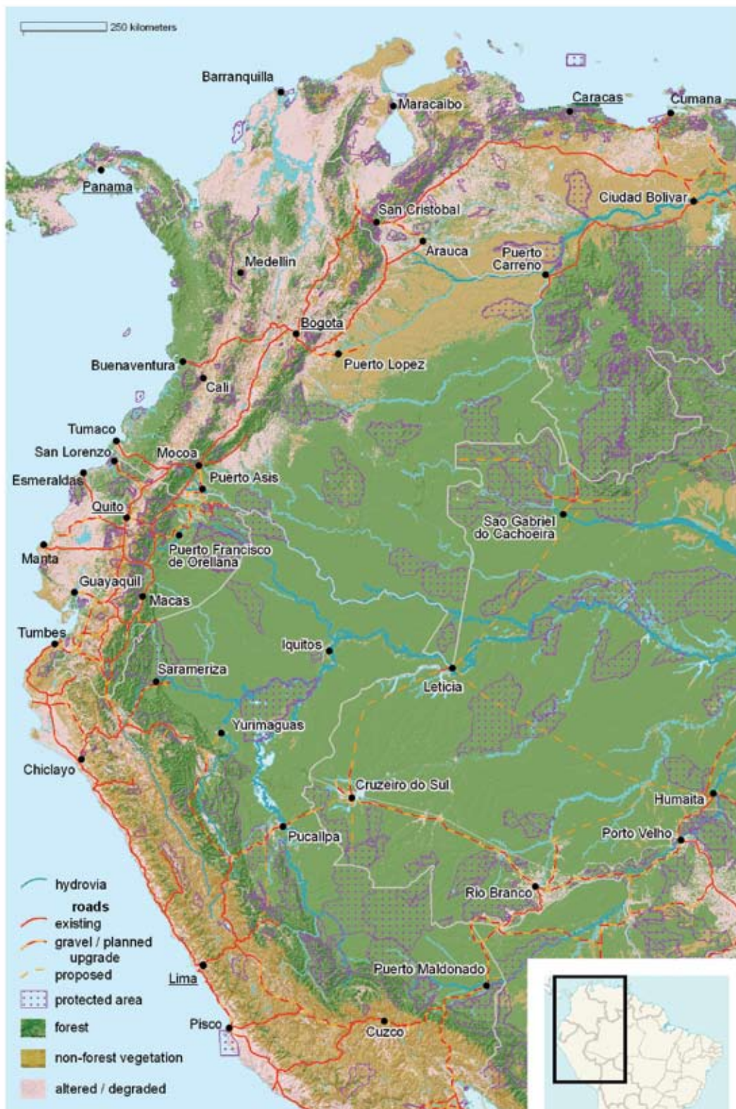
Figure A.1. IIRSA investments in the northwest Amazon and on the Andean piedmont will link the waterways of Amazonian tributaries (Putumayo, Napo, Marañon, and Ucuyali) via trans-Andean highways to the Pacific Coast. However, these East - West highways will also create a piedmont corridor that stretches from Pucallpa in central Peru to the Putumayo in Colombia. Development and deforestation along that corridor will isolate the Andean and Amazonian biota and limit the ability of numerous species to adapt to future climate change.