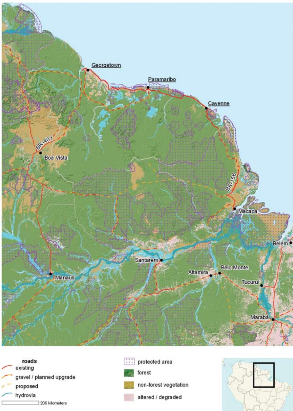
Figure A.3. The ArcoNorte refers to the highway system that will integrate the countries of the Guayana Shield in the northeastern Amazon. This sparsely populated region is generally considered to be the least threatened region of the Amazon, and large areas in Brazil have been designated as protected areas; however, the exploitation of the region’s rich mineral and timber resources may become economically attractive following the completion of IIRSA investments.