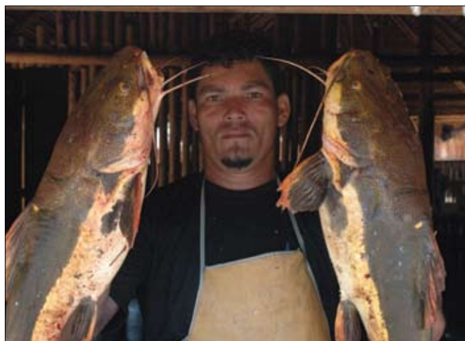
Figure 4.1. Fisherman with migratory Jau Catfish ( Zungaro zungaro ) which, like most Amazonian catfish, is vulnerable to watershed fragmentation from dams and reservoirs. Fishing is the most important economic activity in the Amazon that is wholly dependant on biodiversity. It provides financial opportunity to fishermen, as well as to boat builders, mechanics, and fishmongers.

Fish and wildlife resources illustrate the first constraint. Fishing is the most important and stable component of the Amazonian economy, providing employment and sustenance to an overwhelming majority of its residents, either directly by subsistence fishing or indirectly by commercial and sport fishing (Figure 4.1). The commercial fishing industry in the Brazilian Amazon produces at least $100 million in annual revenues while providing more than 200,000 direct jobs; these statistics do not include related sectors such as boat building, tourism, mechanical shops, and other services (Almeida et al. 2001, Ruffino 2001). There is much concern about the sustainability of current fishing practices, particularly on the main trunk of the Amazon River where human population is relatively dense (Goulding & Ferreira 1996, Ruffino 2001, Jesús & Kohler 2004). Remote regions with fewer human residents still have relatively robust fish populations (Chernoff et al. 2000, Silvano et al. 2000, Reinert & Winter 2002). IIRSA investments in hydrovias will probably lead to higher population densities along rivers and to an increase in overfishing if appropriate management procedures are not implemented. Unfortunately, most Amazonian fishermen are impoverished and would probably never be convinced to pay for the right