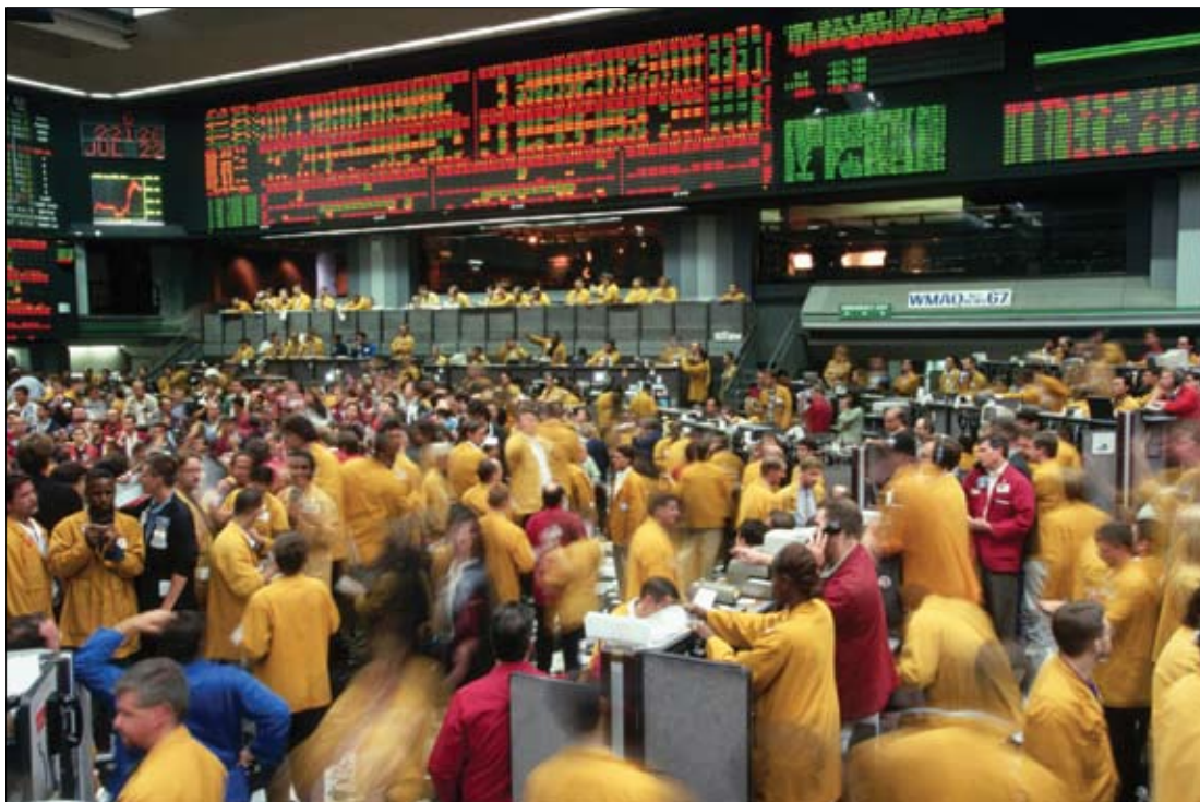
Figure 4.4. Carbon credits are increasingly being treated as a commodity, and proposals to certify reductions in emissions from deforestation (RED) may soon be approved for trading on international markets.