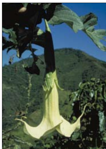
Figure 4.2. The tree datura [ Brugmansia arborea (L.) Lagerh.] is used by Andean shamans for its curative and hallucinogenic properties; the active ingredients are tropane alkaloids, mainly scopolamine, which has multiple pharmaceutical uses, including pupil dilation and as a treatment for motion sickness. Like many pharmaceuticals, the intellectual property rights of these compounds are in the public domain because they come from centuries of prior use and knowledge.

Thus, even though the importance of natural products and the intrinsic value of biodiversity have been reaffirmed as an economic asset, the cost associated with research, drug development, and the mechanics of the marketplace make it unlikely that civil society will be able to require pharmaceutical companies to monetize that value in any meaningful way. Even if the countries of the Andes and Amazon were willing to open their forests for unlimited pharmaceutical prospecting, it is unlikely that the major pharmaceuticals would make any significant investments, and certainly not on the scale necessary to create an economic incentive to conserve the Amazon.