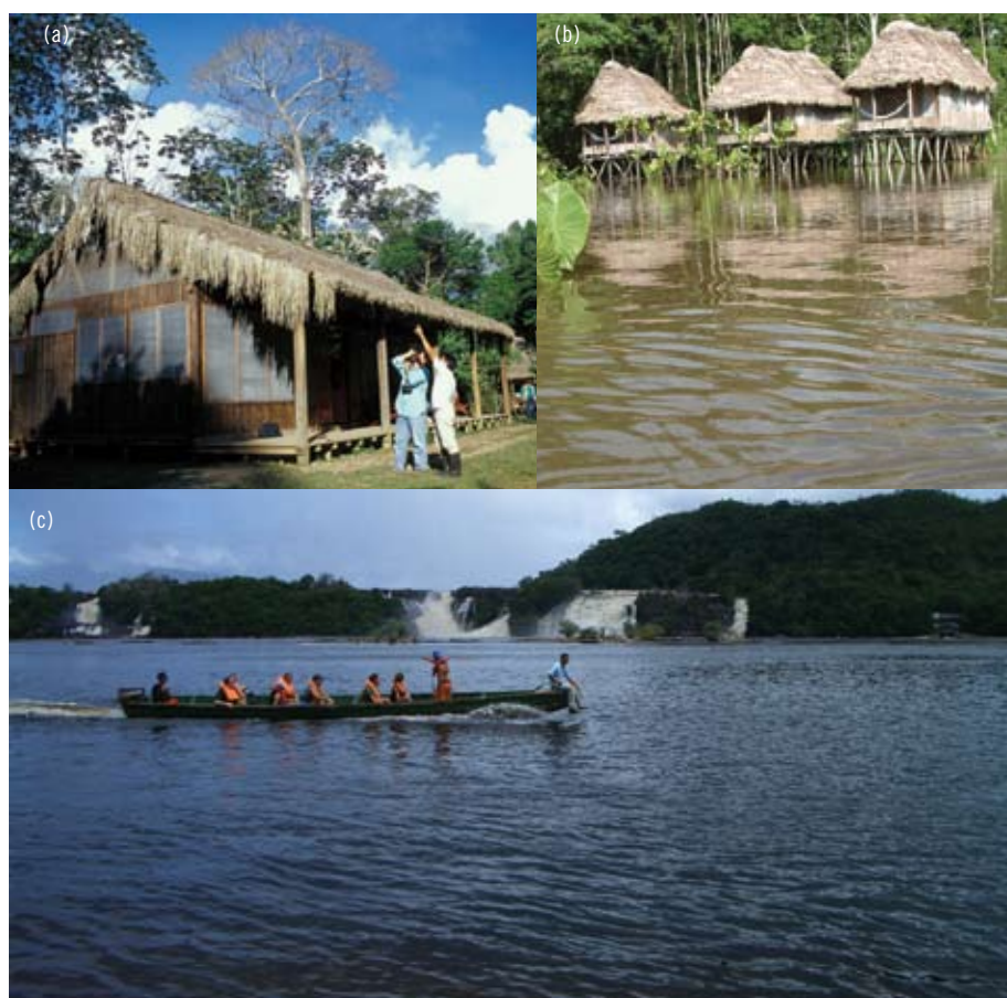
Figure 4.3. Ecotourism has enjoyed steady growth over the last two decades, providing economic opportunities for both the private sector and traditional communities: (a) Chalalan Ecolodge in Madidi National Park, Bolivia, (b) Kapawi Ecolodge and Reserve on the Pastaza River in Ecuador, and (c) Laguna Canaima in Canaima National Park, Venezuela.