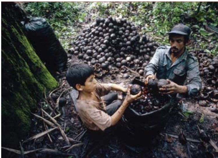
The collection and processing of Brazil nuts is considered by many to be the quintessential sustainable forest enterprise and is the mainstay of many traditional communities.

The Amazon Wilderness Area and the Tropical Andes and Cerrado hotspots provide ecosystem services to the world via their biodiversity, their carbon stocks, and their water resources. It is difficult to estimate the economic value of these resources due to their intangible nature and the tendency of traditional economists to discount goods and services that cannot be monetized in a traditional market (Costanza et al. 1997). One method of valuating ecosystem services is to estimate their replacement costs; simply put, how much would it cost human society to replace those good and services or, if they are irreplaceable, how much wealth has been lost? (Balmford et al. 2002). Regardless of how difficult it is to measure precisely, there is overwhelming agreement that ecosystem services are extremely valuable to society at global and continental scales alike, although market mechanisms and human nature tend to discount or even disregard that value when individual decisions are made at the local scale (Andersen 1997). The growing concern over global climate change and biodiversity extinction has stimulated efforts to estimate the value of ecosystem services and to create mechanisms whereby communities that choose to conserve natural habitats are compensated by other communities that enjoy the benefits of those services (Turner et al. 2003).