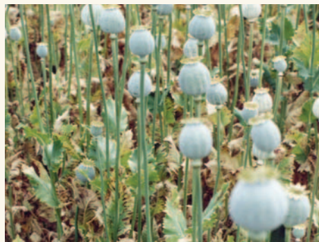
(b) Maturing capsules (Tasmanian Alkaloids)