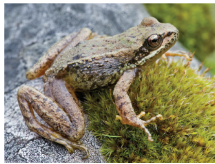
Amolops sp. (taxonomic status needs further confirmation)