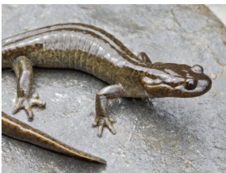
Alpine stream salamander ( Batrachuperus tibetanus )