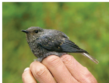
Plumbeous water redstart ( Rhyacornis fuliginosus ) captured by mist net