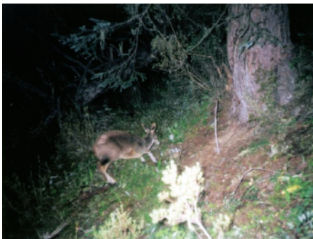
Alpine musk deer ( Moschus sifanicus ) captured by camera-trap