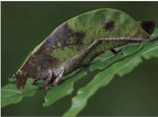
Decayed leaf katydid ( Weissenbornia praestantissima )