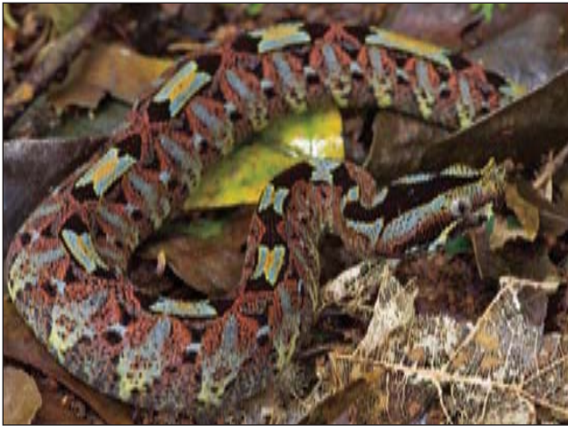
Rhinoceros viper ( Bitis nasicornis )