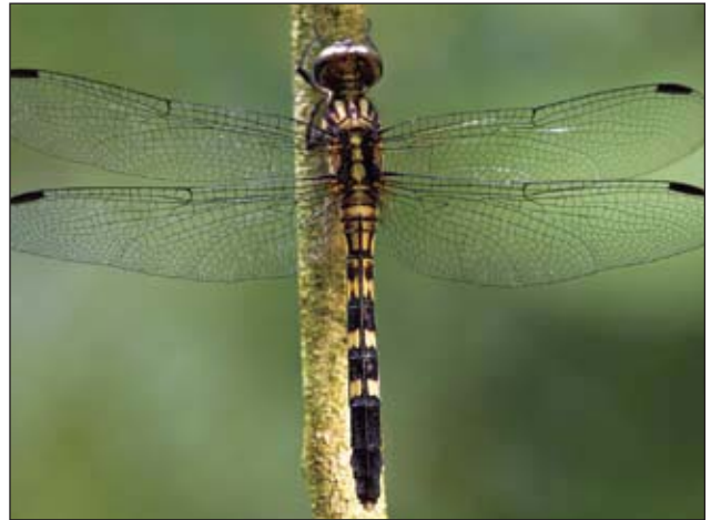
A female of Orthetrum julia (the Julia Skimmer), one of Africa's most common dragonfly species