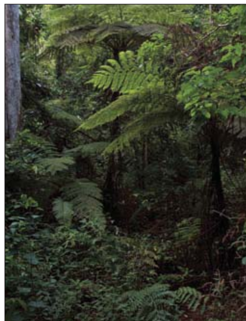
Atewa tree fern ( Cyathea manniana )