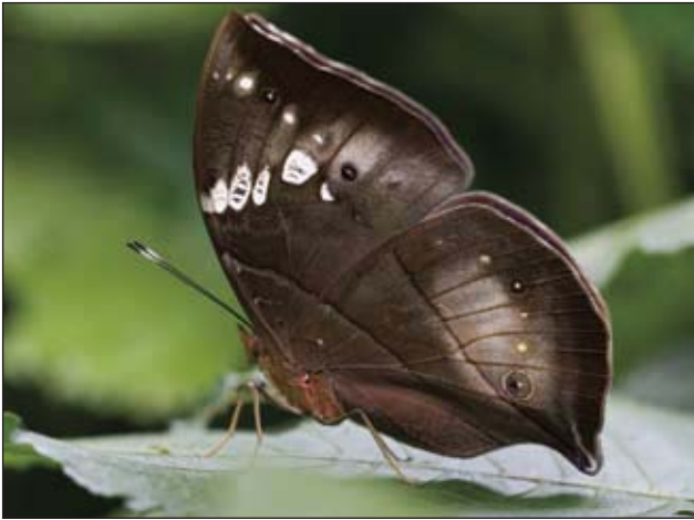
Butterfly ( Kallimoides rumia )