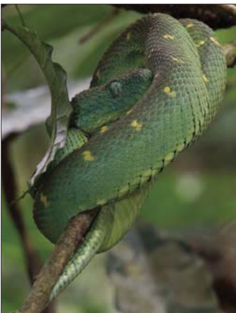
Green tree viper ( Atheris chlorechis )