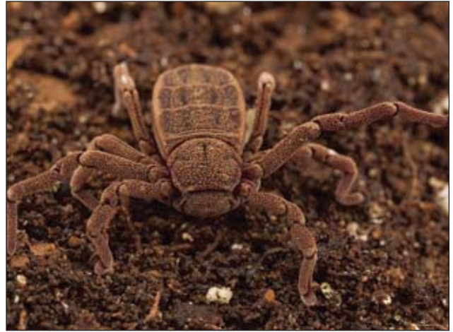
A new species of tick spider ( Ricinoides sp. n.)