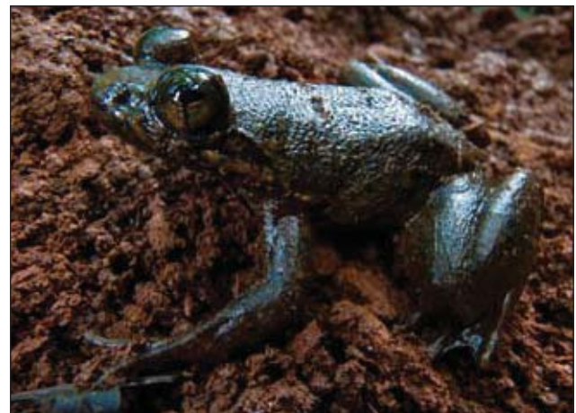
The aquatic Conraua derooi is Critically Endangered and may have its largest populations in the Atewa Range Forest Reserve