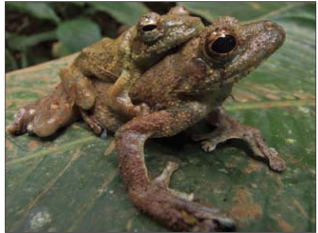
Tree frogs in amplexus ( Chiromantis rufescens )