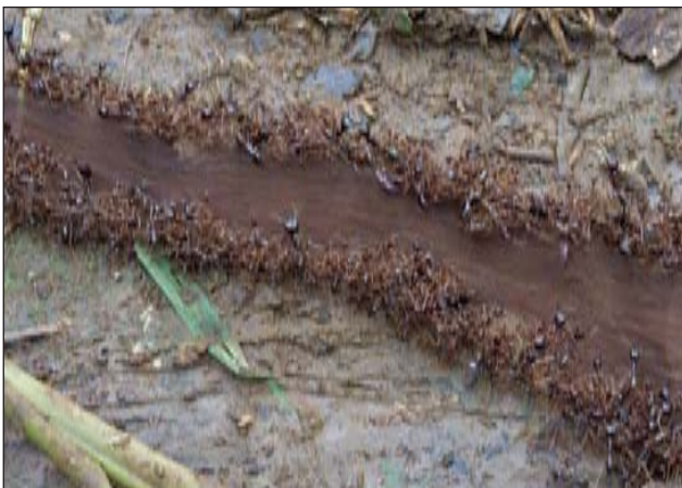
A stream of driver ants ( Dorylus sp.)