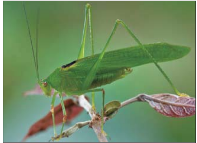
Leaf katydid ( Poreuomena lamottei )