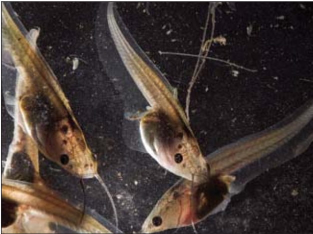
Tadpoles of the clawed frog ( Silvarana tropicalis )