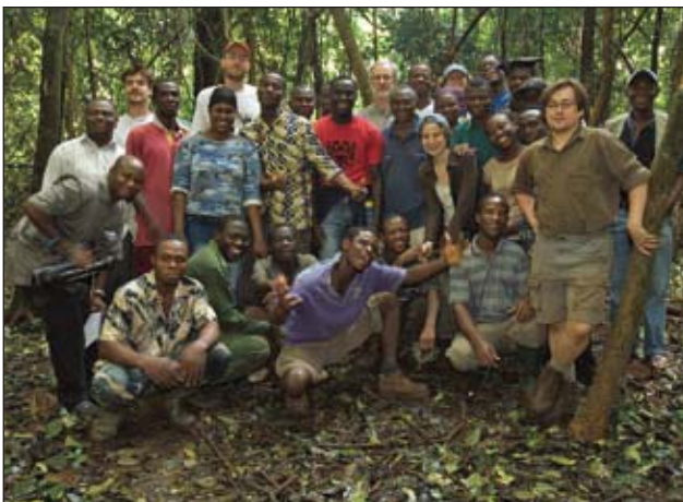
The Atewa RAP team