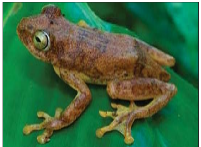
Hyperolius bobirensis is known only from two other Ghanaian sites. Characteristics are its large size and the granular back skin.