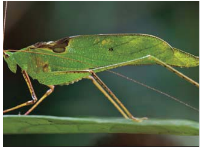
A new species of katydid ( Tetraconcha sp. n.)