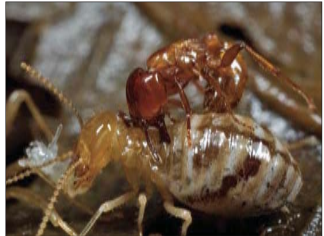
A driver ant ( Dorylus sp.) attacking a termite