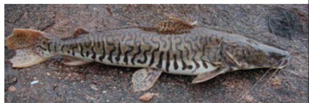
Figure 8.3. Two large fish species of the Middle Palumeu River. A. Pacu Tometes lebaili (Serrasalminae). B. Tiger catfish Pseudoplatystoma tigrinum (Pimelodidae).