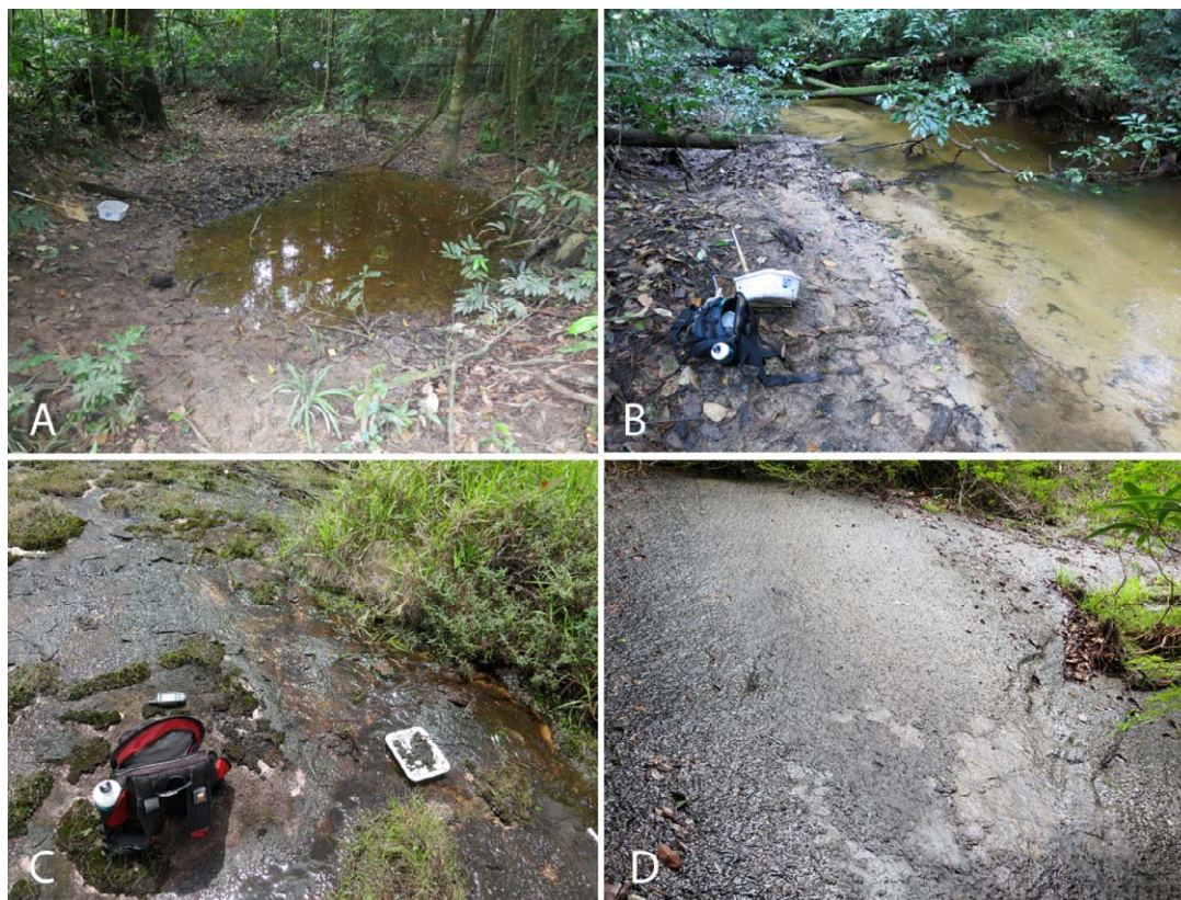
Figure 4.1. Selected collecting event photographs, with field numbers given in brackets. A) Camp 1, detrital pool along floodplain of small upper Palumeu tributary [SR12-0311-01A], B) Camp 1, tributary of the upper Palumeu [SR12-0314-01A], C) Camp 2, typical seepage habitat on the Grensgebergte summit [SR12-0312-01A], D) Camp 4, large flowing seepage near the base of Kasikasima [SR12-0324-01C].

Most collecting was done along a cut trail south that continued to the Brazilian border, and in the immediate (<1 km) vicinity of basecamp. Along the trail a few kilometers south