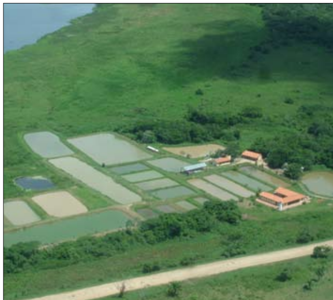
Figure 7.1. The Amazon needs a new development paradigm in which natural resources are transformed into goods and services that are competitive in global markets; for example, this experimental fish farm in Bolivia relies on the region's abundant surface water, native herbivorous fish, and locally produced soy and corn.

Under the best of circumstances, protected areas and indigenous reserves will be consolidated to function as biological reserves. However, it is unlikely that more than 30–40 percent of the land surface in the Amazon will be set aside for this purpose. In addition, indigenous and extractive reserves will face increased degradation unless the so-called sustainable forestry model is significantly modified or communities choose to opt out of that exploitation alternative. Outside of the protected area and indigenous reserve systems, the landscape will be subject to the inevitable forces of the market.