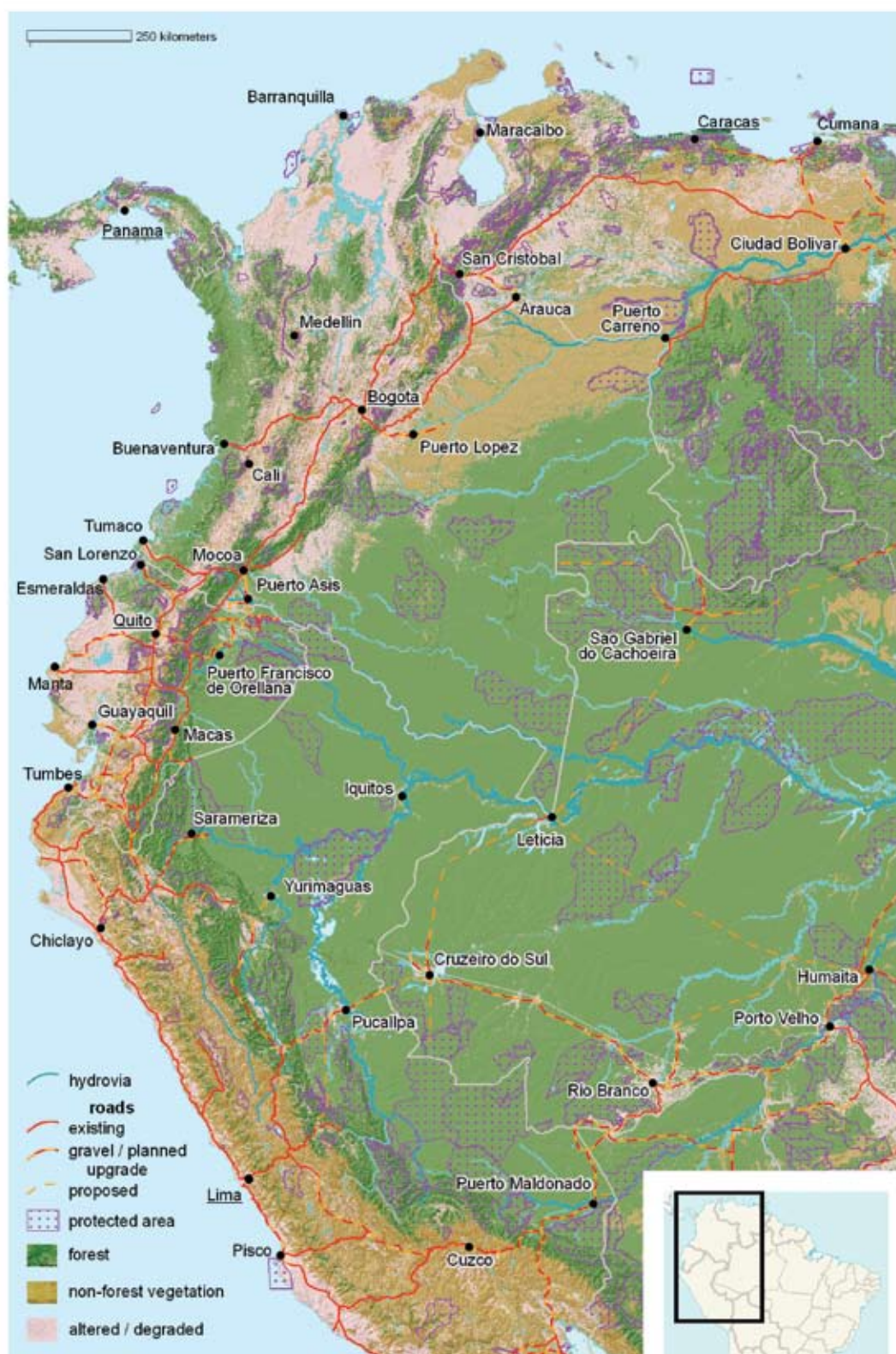
Figure A.1. IIRSA investments in the northwest Amazon and on the Andean piedmont will link the waterways of Amazonian tributaries (Putumayo, Napo, Marañon, and Ucuyali) via trans-Andean highways to the Pacific Coast. However, these East - West highways will also create a piedmont corridor that stretches from Pucallpa in central Peru to the Putumayo in Colombia. Development and deforestation along that corridor will isolate the Andean and Amazonian biota and limit the ability of numerous species to adapt to future climate change.