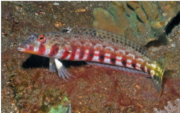
Plate 3.6. Parapercis bimaculata , 11 cm total length.