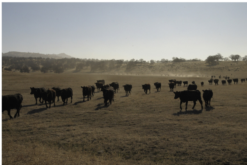
Figure 1. Extreme drought on California's annual rangelands (Sutter County, California). At the time of this photo (January 2014), drought conditions were extreme to exceptional for 67% of the state. 4

characteristically long, hot, and dry summers during which dryland forage quality declines over the season. Escalating drought frequency and severity compound this challenge, delaying or eliminating the fall, winter, and spring rains that lead to renewed green forage. Long-term drought poses significant, cumulative challenges to sustaining ranching operations and the ecosystem goods and services they provide. Severe and widespread drought can trigger undesirable ecological shifts, which can have long-term impacts on forage and livestock production and directly threaten livelihoods of families and communities.