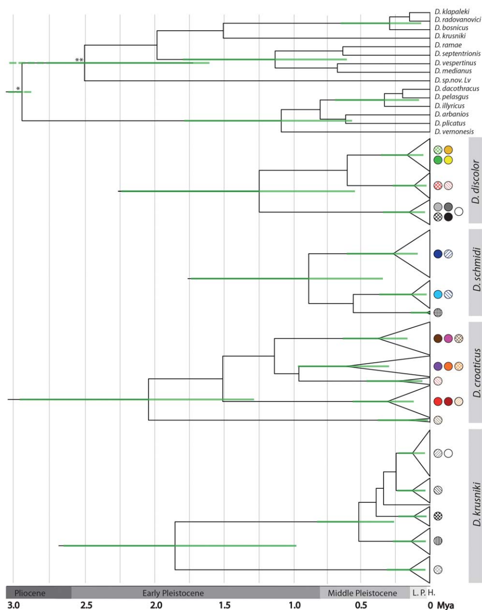
Figure 2. Estimates of divergence times for 15 endemic Western Balkan Drusus species of monophyletic origin and intraspecific divergence of the 4 target species based on BEAST analysis. Individual haplotypes were collapsed by clades. Clades are coded according to their geographic origin (see Fig. 1). Green bars indicate 95% highest posterior density (HPD) intervals for divergence times of individual nodes (Node *: mean age estimate = 5.288 Mya and 95% highest posterior density [HPD] interval = 7.77–3.31 Mya; Node **: 95% HPD interval = 3.72–1.61 Mya). Vertical grey lines show 250 ky increments. Epoch boundaries are shown according to Litt et al. 2008 (L.P. = late Pleistocene, and H. = Holocene).

of the karstification process in the region (Sket 1999, Mihevc et al. 2010). Some of our estimates of divergence times differ from previous estimates of divergence of Drusus endemics in the Dinaric region of the Western Balkans. Previous dates were estimated from a more limited data set and with different models applied for divergence estimation (Previšić et al. 2009). Both factors can affect divergence time estimates (Drummond et al. 2006). However, results of previous studies and our results support regional speciation and differentiation beginning in the late